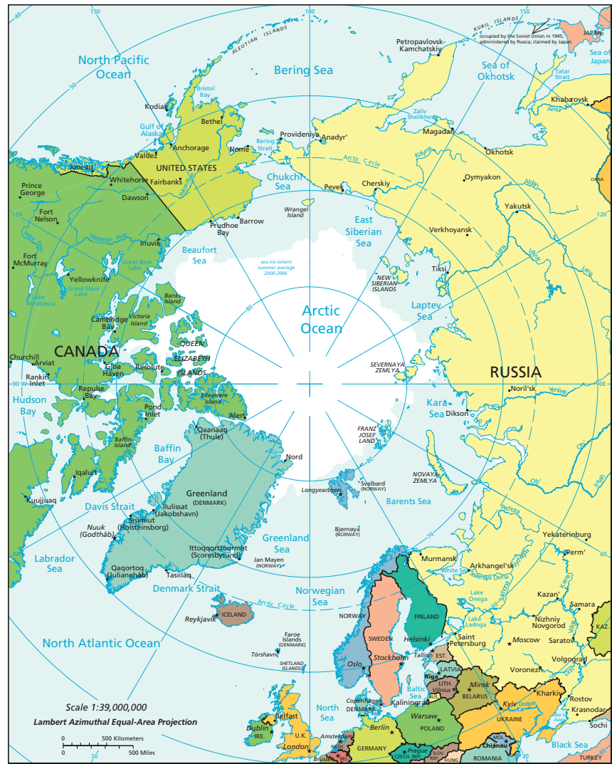
Figure 1.1 Map of the Arctic

SOURCE: Central Intelligence Agency, Political Arctic Region, "World Factbook, undated. RAND RR1731-1.1