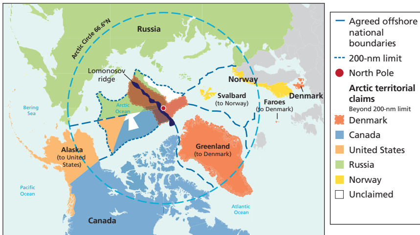
Figure 3.3 Overlapping Claims in the Arctic