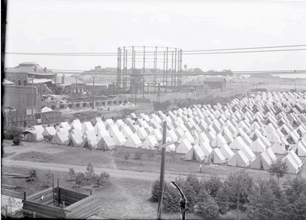
Figure 14. Marina Refugee Camp

Note: The US Army General Staff in Washington, DC worked tirelessly to deliver emergency resources, such as these tents at the Marina Refugee Camp.