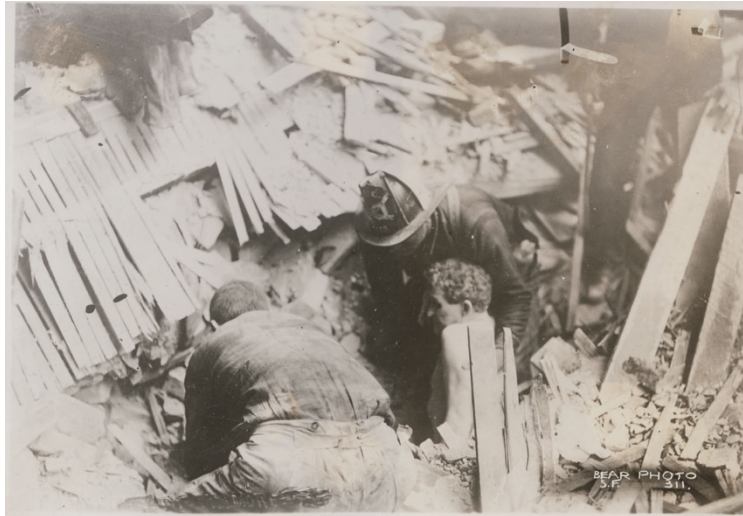
Figure 4. A Fireman and Rescuer Pull a Survivor from the Rubble of Wilcox Building at Second and Jessie Street

repairs, in June 1906, the National Board of Fire Underwriters estimated half of the city's water was still being lost through breaks. 122