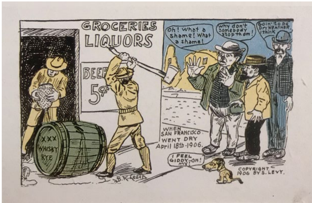
Figure 10. When San Francisco Went Dry

Note: This postcard was produced in mass quantity in the Bay Area and mailed to families around the country, waiting for news of survival. In this cartoon soldiers are shown destroying alcohol in a grocery store while drunkards (depicted with large dark noses) look on disparagingly. The caption "When San Francisco Went Dry," demonstrates the widespread awareness of the citizens that soldiers had seized and destroyed liquor in the city.