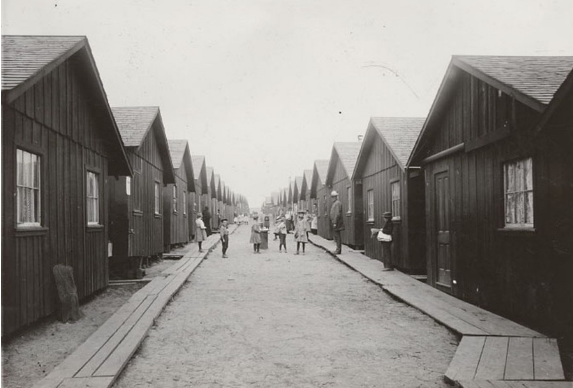
Figure 15. Camp 13 on Franklin Square in the Months following the Earthquake