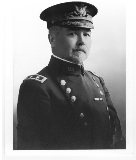
Figure 1. Major General Frederick Funston

quietly, ‘It would be a good choice.’” 80 Sure enough, Funston’s subordinate, John J. Pershing was officially selected two months later to command the American Expeditionary Force.