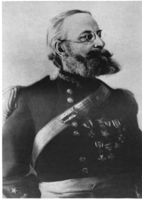
Figure 2. Major General Adolphus W. Greely, Chief of the US Army Signal Corps

wireless telegraphy, the advent of military aviation, and aerial reconnaissance. 93 In recognition of his contributions to the Signal Corps, as well as his service as an arctic explorer, and at the urging of Mitchell, Greely received the Medal of Honor for lifetime achievement in 1935 (only the second of two ever to have been given for service). 94 After being promoted to major general in March of 1906, Greely was assigned as commander of the Army's Pacific Division in San Francisco, replacing Major General Arthur MacArthur.