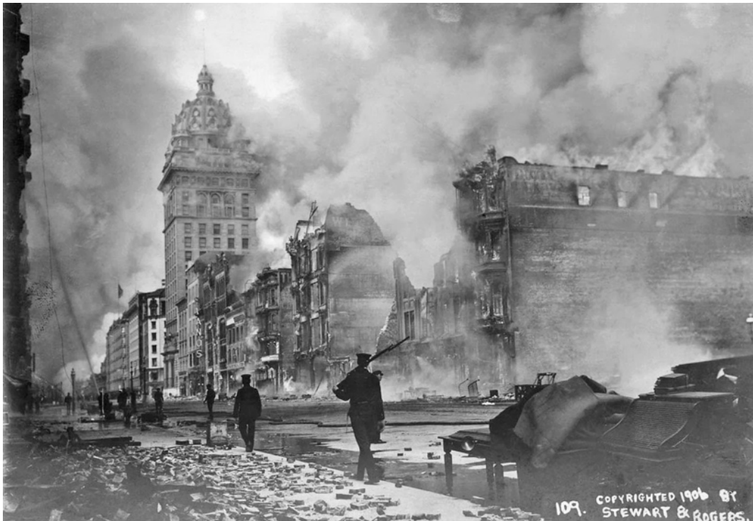
Figure 8. Armed Soldier or National Guardsman Walking up Market Street while San Francisco Burns

very practical weapon, but are known to be a psychological tool against an enemy. In this case, the bayonets fixed to the Krag–Jørgensen rifles of the soldiers, sailors, and marines sent to help the citizens of San Francisco sent a mixed message (see figure 8).