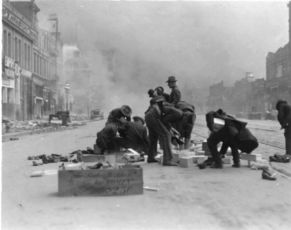
Figure 11. Soldiers Loot Women's Shoes on Market Street