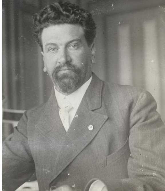
Figure 3. Mayor Eugene H. Schmitz