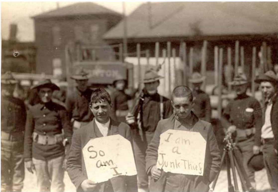
Figure 9. Looters

victims of the disaster. However, analysis of imagery and historical accounts of the time tell a different story. As mentioned, Schmitz's initial concern was a mob of looters. To counter this threat, he also created a "Special Police" force who were nothing less than sanctioned vigilantes. Frightening as this sounds, the city's raucous history included formations of "vigilance committees" that helped keep the peace in the years after the California Gold Rush, and was something the city's long-term residents would have been familiar with. The suspension of due process left any of the city's citizens open to the possibility of being shot on site with no questions asked. (see figure 9).