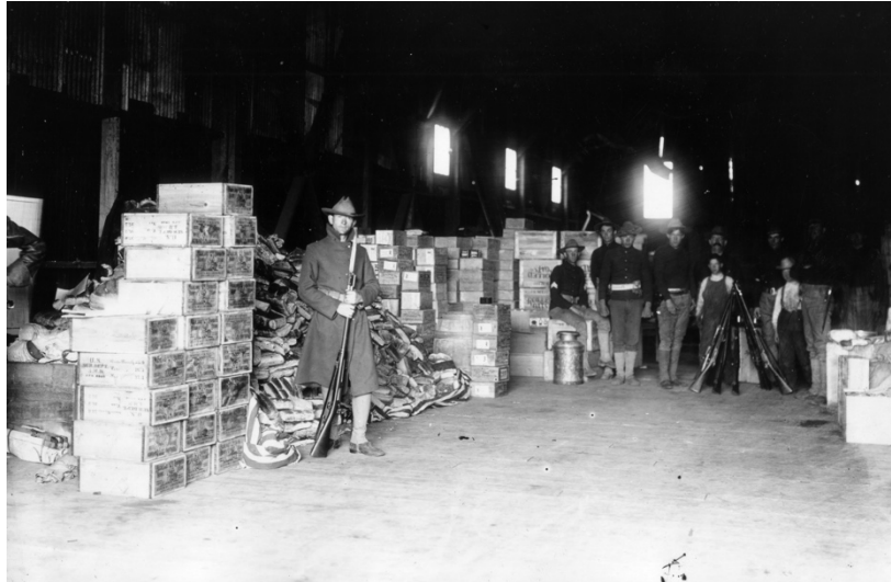
Figure 13. Soldiers Guarding Relief Supplies after Earthquake

logistics enterprise brought to bear by the army facilitated the distribution of daily rations for an average of 240,143 people from 19 April to 12 May 1906. 264