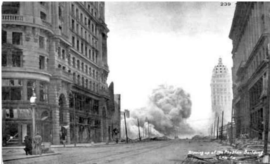
Figure 12. The Remains of the Phelan Building were Dynamited on 20 April 1906

Beginning on the 18th, a joint force of soldiers, sailors, firefighters, and civilian volunteers set to work demolishing buildings. How they chose which buildings to demolish is unclear. Greely's report indicated that a committee appointed by Schmitz approved which structures could be brought down. Initially, they decided that only those buildings currently in flames could be demolished. The biggest problem with this strategy was the spread of burning materials launched into the area and carried to city blocks not currently on fire. By the afternoon of the 19th, the civil and military authorities determined that they needed a new strategy, and decided to work ahead of the flames to create a firebreak (see figure 12). Overall responsibility for the demolition was delegated to two artillery officers, Captain LaVert Coleman and 1st Lieutenant Raymond Briggs. Coleman's account was included in Greely's reports.