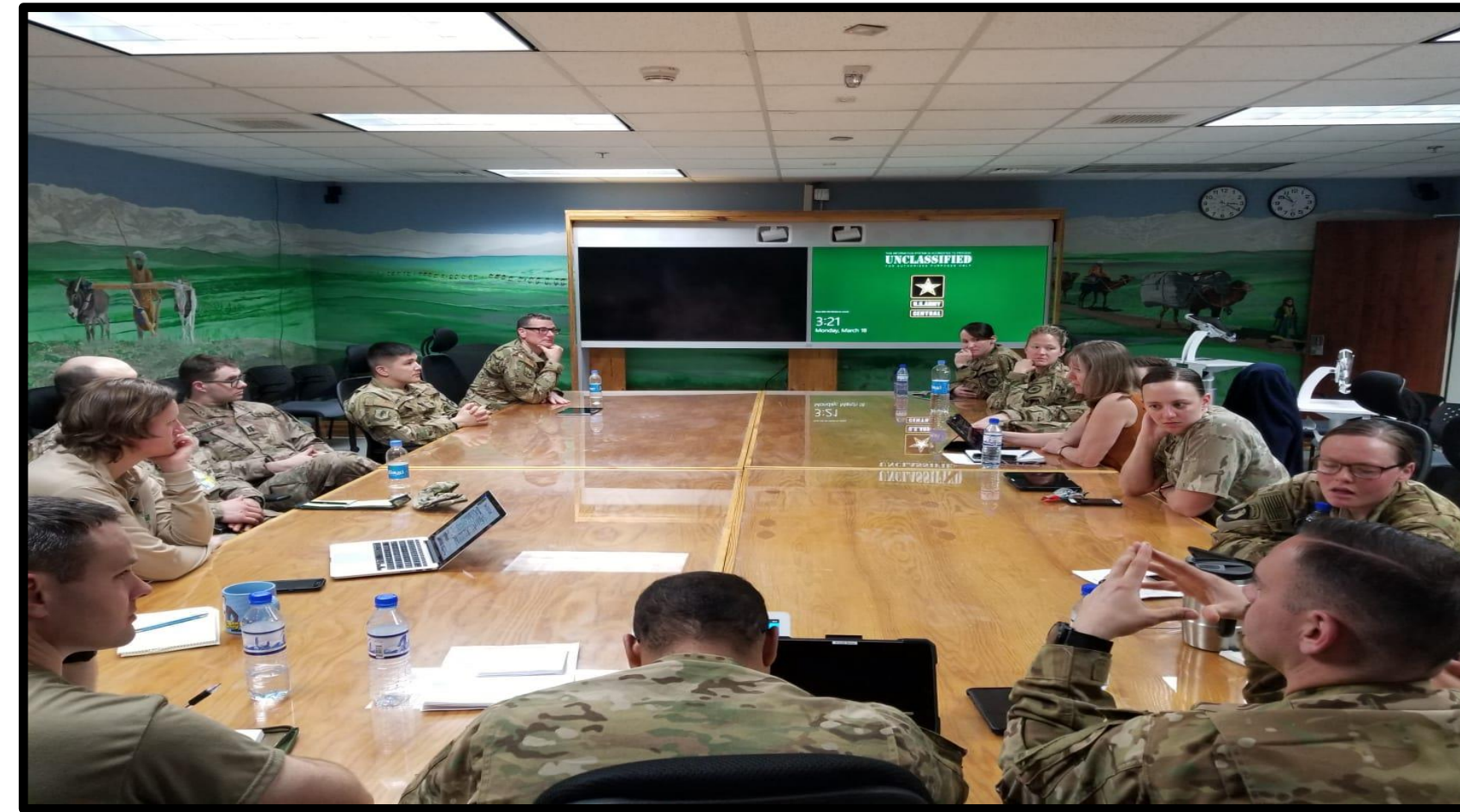
Table top exercise at CJTH Role 3 hospital, BAF, Afghanistan