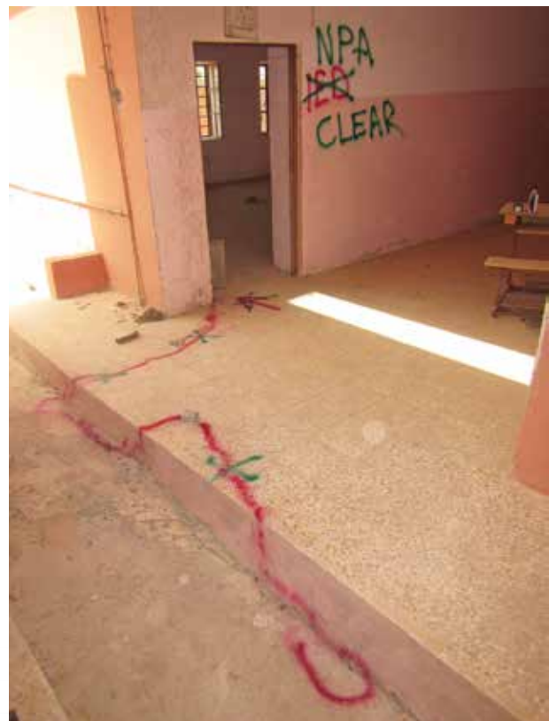
This primary school classroom bears the marking from the HRS clearance process.

Beyond survey and clearance, HMA activities include risk education and community liaison work that have positive indirect effects on clearance. NGOs train local teams who, in turn, teach local people how to recognize, avoid, and report hazards. The obvious benefit is saved lives. But local reporting also provides a massive boost in information collection and task prioritization. Further, NGOs gain community acceptance that can also have security benefits on the ground, particularly in countries that are suspicious of foreign people and organizations.