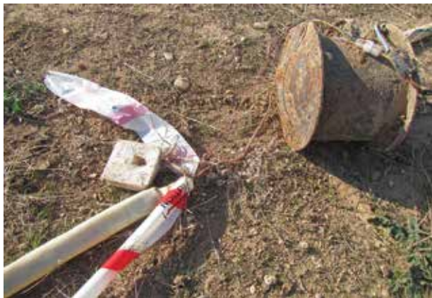
The same PPIED after neutralization. Note the square, white electronic anti-lift device on the left.

repurposed material. Typical net explosive quantity (NEQ) ranges from 6 to 20 kg (13 to 44 lbs), although much larger charges have been found when targeting vehicles. Secondary anti-lift features are common, as are dual pressure plates. If on the surface, even a child's footstep is enough pressure to function the device.