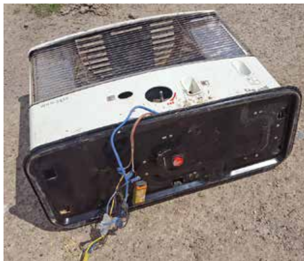
This kerosene heater was modified into an IED that incorporates both a crush necklace and a built-in, anti-lift feature. These devices and others like them are sitting among the rubble inside abandoned homes awaiting returning families.

The successes of the Anti-Personnel Mine Ban Convention (APMBC) and munition stockpile reduction projects have limited the availability of these weapons to nonstate actors. In the beginning of the insurgency campaigns in Afghanistan and Iraq, IEDs tended to use main charges of unexploded projectiles or other factory-produced ordnance. When the stock of munitions ran out, the bomb makers turned to homemade explosive (HME) for main charges. By manufacturing HME from common precursors such as aluminum, urea, ammonium nitrate, and potassium chlorate, the bombers created a nearly inexhaustible supply chain.