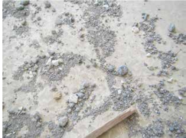
The rubble from an adjacent IED detonation makes the crush necklace even harder to see.

Yet the charges are powerful enough to destroy a truck and kill the occupants. PPIEDs currently encountered in Iraq are generally robust in design and can remain functional for several years. Other improvised mines, which mimic factory-produced mines in form as well as function, use mechanical cocked-striker fuzing, and these may have even longer operational lifespans than electronically-fired systems. ISIS deploys these improvised mines in long, patterned rows to defend against