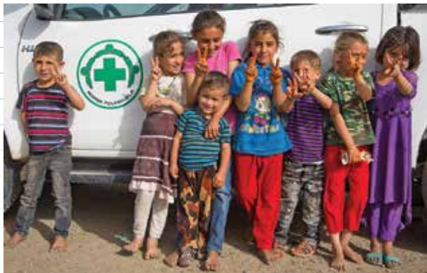
Beneficiaries of NGO clearance. These children can now return to school after more than two years without formal education.

Based on the authors' experience in the commercial and HMA sectors, NGOs are far more cost-effective than for-profit companies. Because NGOs operate at lower costs, and because they actively work to build self-sustaining national capacity, the value per dollar and sustainability are much better. However, highly-capitalized commercial companies are more agile in initial deployment and redeployment than NGOs.