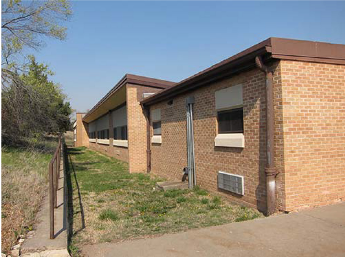
Photo (date): 104L.JPG (taken 4/4/2016) Caption: West elevation, view to east

Photo (date): 104K.JPG (taken 4/4/2016) Caption: West elevation, view to north