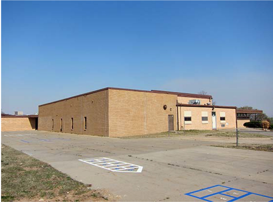
Photo (date): 104P.JPG (taken 4/4/2016) Caption: South elevation, view to north

Photo (date): 104O.JPG (taken 4/4/2016) Caption: Southwest oblique, view to northeast