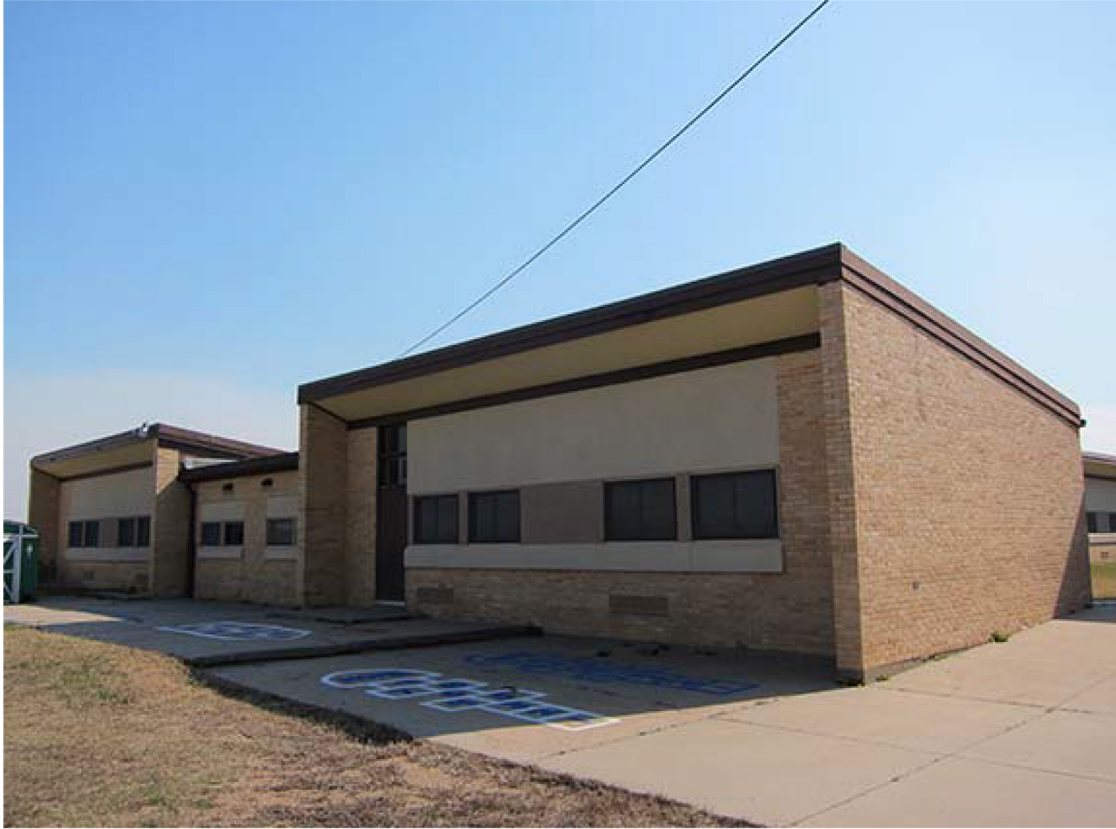
Photo (date): 104H.JPG (taken 4/4/2016) Caption: North elevation, view to south

Photo (date): 104G.JPG (taken 4/4/2016) Caption: Northwest oblique, view to southeast