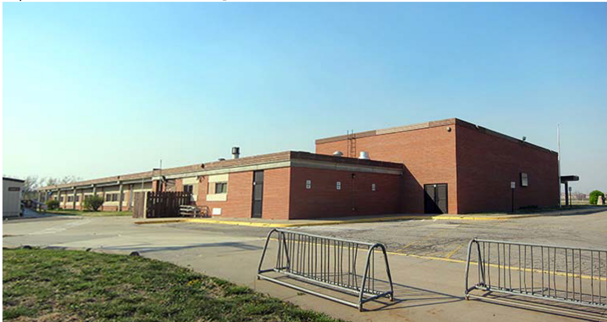
Photo (date): 6344B.JPG (taken 4/4/2016) Caption: Southeast oblique, view to northwest

Map was redacted from publicly available version.