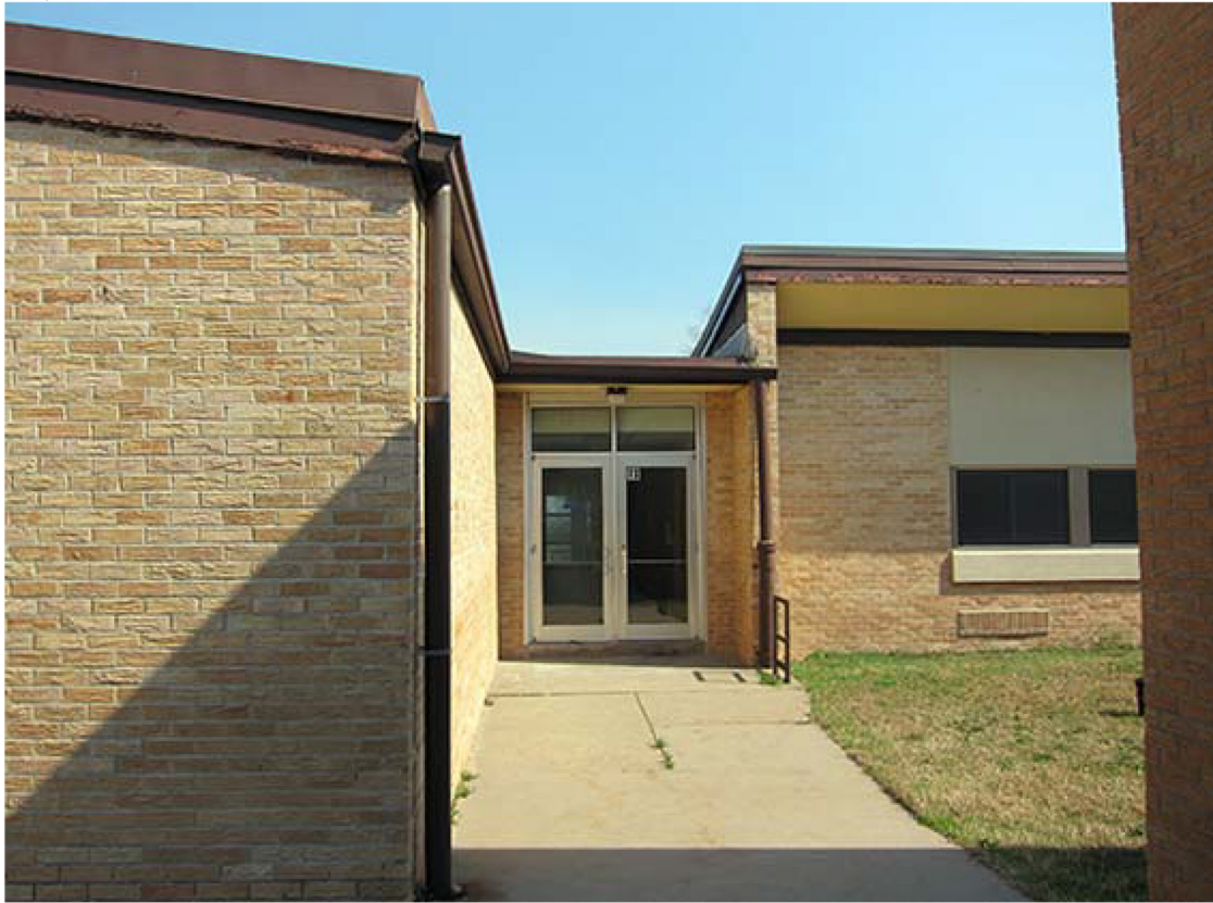
Photo (date): 104J.JPG (taken 4/4/2016) Caption: Southwest elevation, view to northwest

Photo (date): 104I.JPG (taken 4/4/2016) Caption: West elevation, view to east