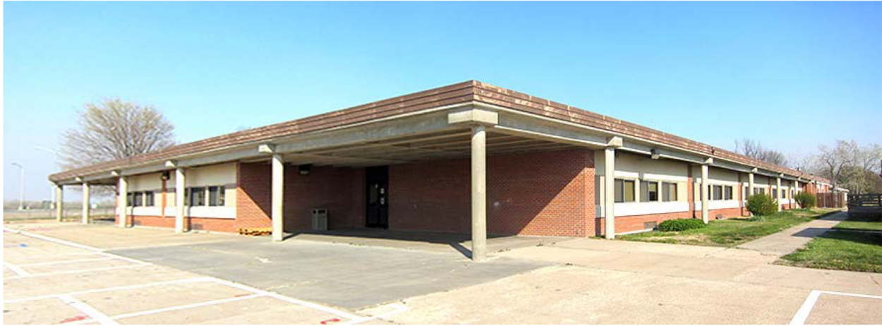
Photo (date): 6344J.JPG (taken 4/4/2016) Caption: South elevation, view to north

Photo (date): 6344I.JPG (taken 4/4/2016) Caption: Southeast oblique, view to northwest