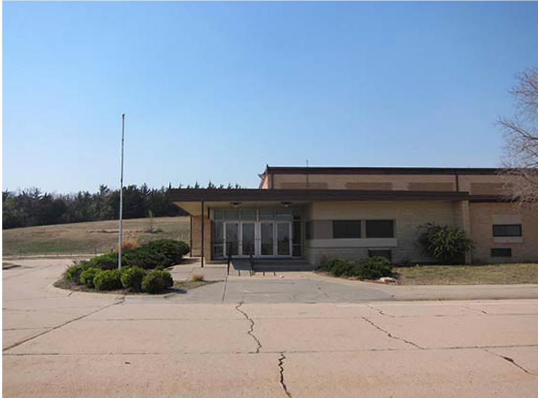
Photo (date): 104D.JPG (taken 4/4/2016) Caption: East elevation, view to northwest

Photo (date): 104C.JPG (taken 4/4/2016) Caption: East elevation, View to west