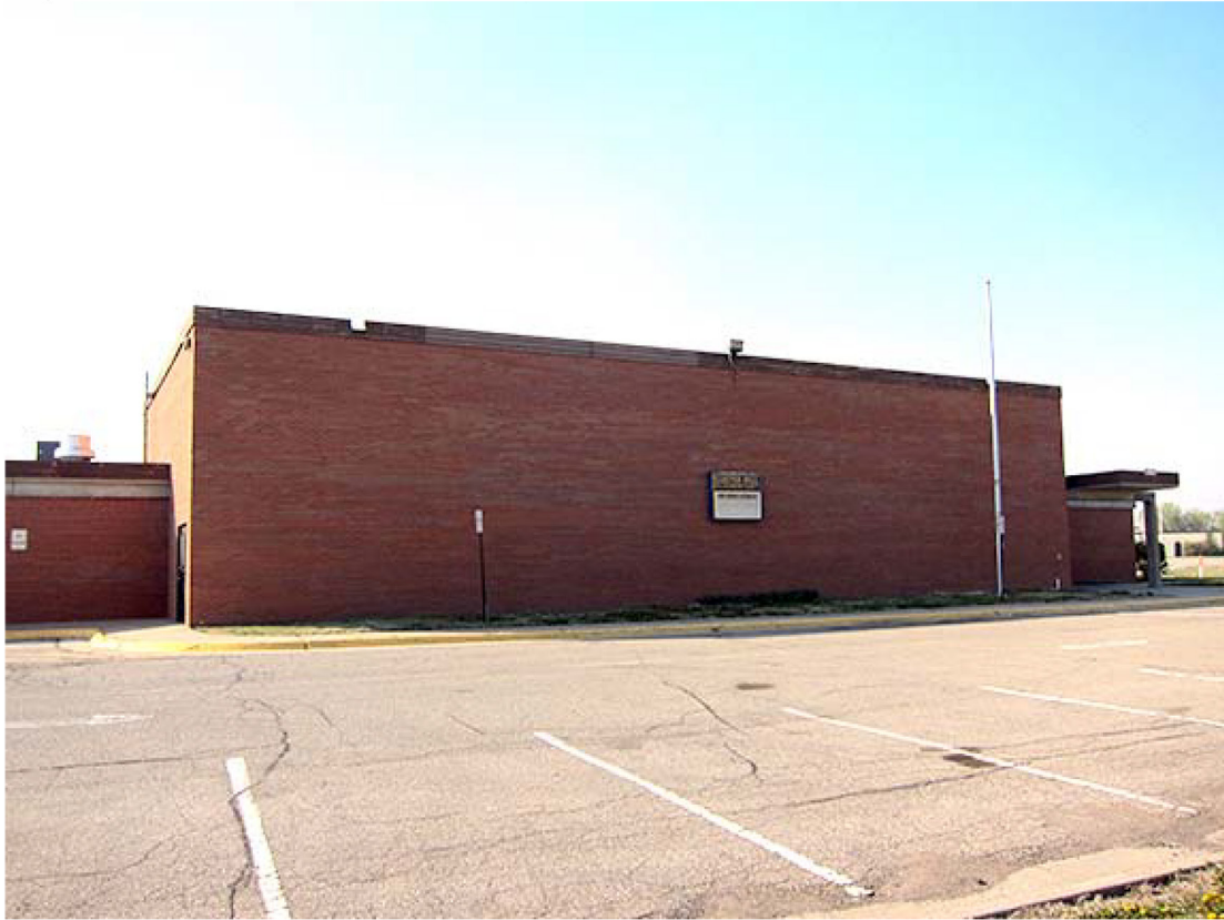
Photo (date): 6344D.JPG (taken 4/4/2016) Caption: North elevation, view to south

Photo (date): 6344C.JPG (taken 4/4/2016) Caption: East elevation, view to west