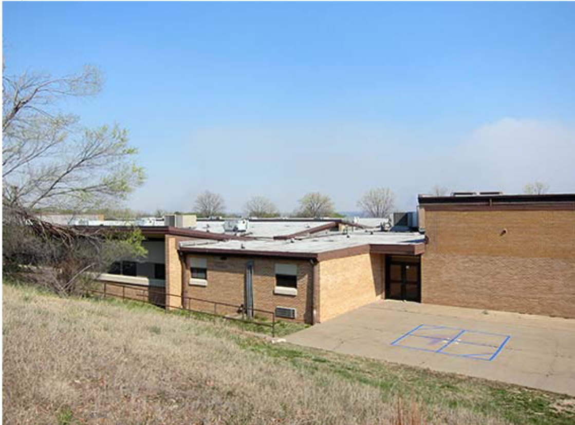
Photo (date): 104N.JPG (taken 4/4/2016) Caption: west elevation, view to east

Photo (date): 104M.JPG (taken 4/4/2016) Caption: West elevation, view to east