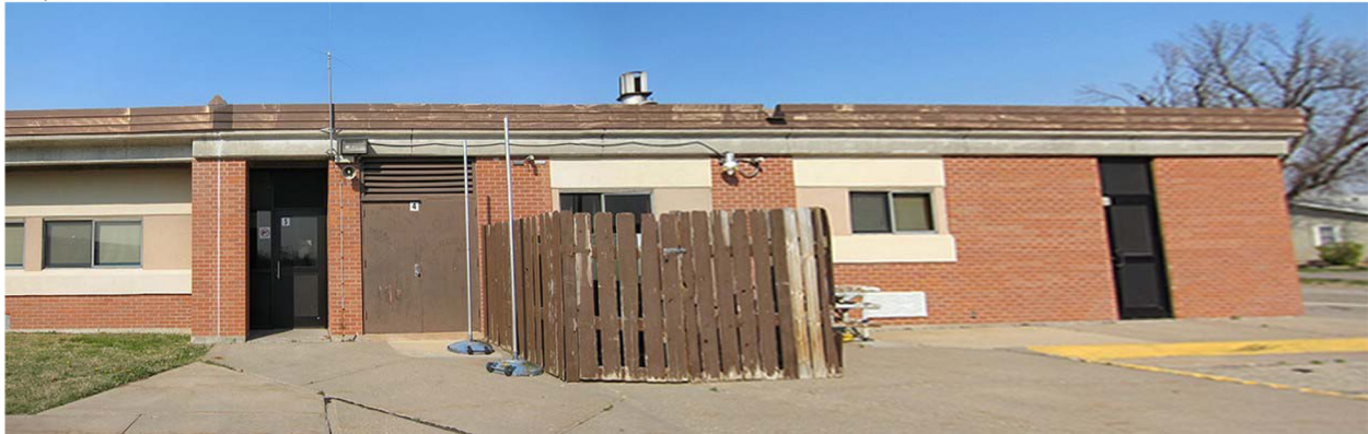
Photo (date): 6344K.JPG (taken 4/4/2016) Caption: Southeast oblique, view to northwest