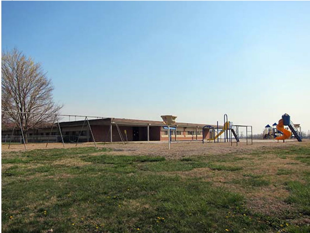
Photo (date): 6344H.JPG (taken 4/4/2016) Caption: Southwest oblique, view to northeast

Photo (date): 6344G.JPG (taken 4/4/2016) Caption: West elevation, view to east