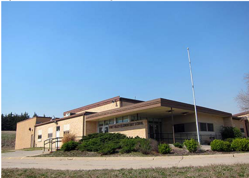
Photo (date): 104B.JPG (taken 4/4/2016) Caption: Southeast oblique, view to north

(Map was redacted from publicly released version.)