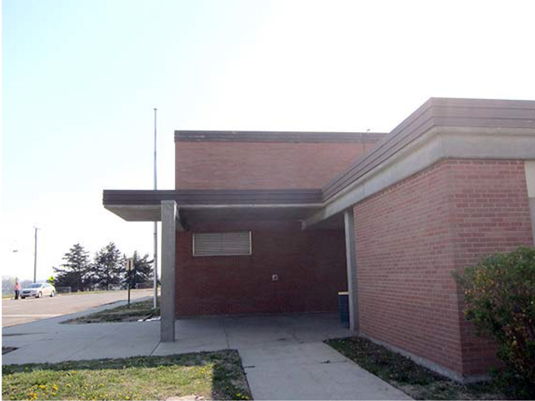
Photo (date): 6344F.JPG (taken 4/4/2016) Caption: Northwest oblique, view to southeast

Photo (date): 6344E.JPG (taken 4/4/2016) Caption: Northeast oblique, view to southwest