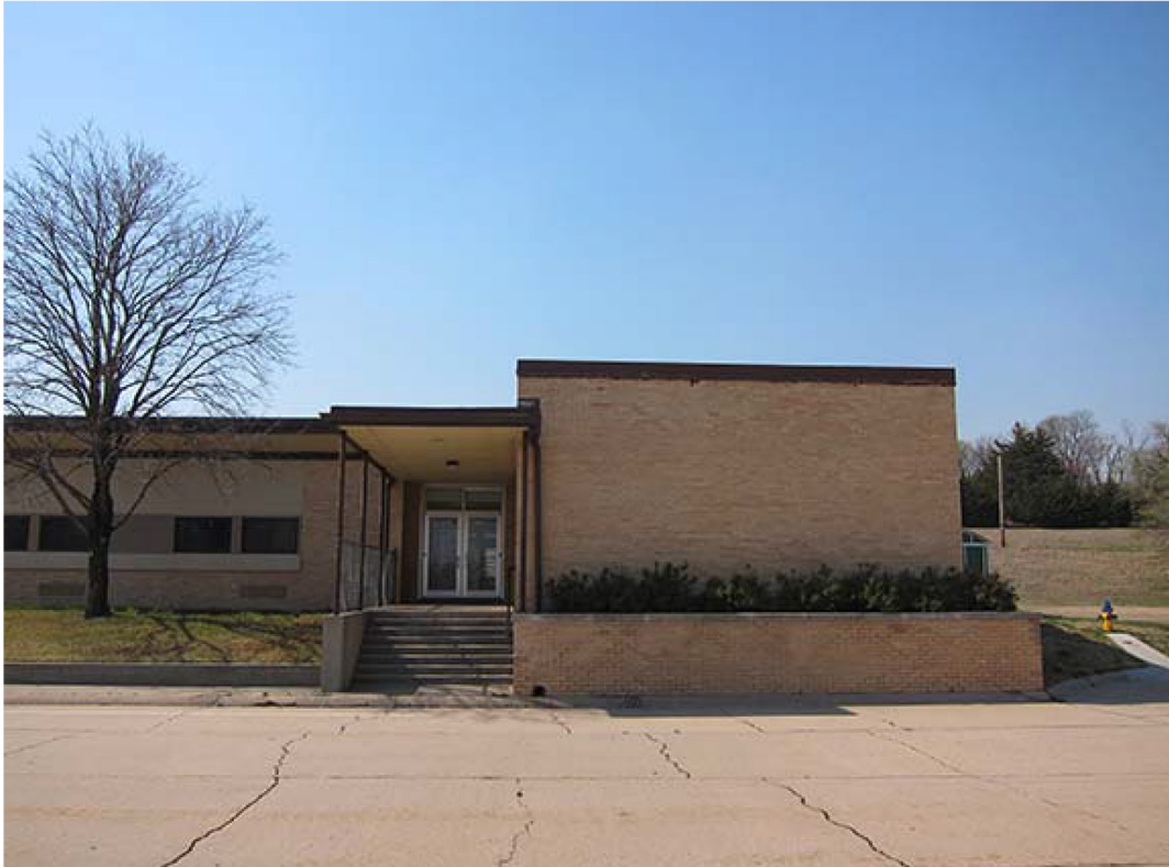
Photo (date): 104F.JPG (taken 4/4/2016) Caption: North elevation, view to south

Photo (date): 104E.JPG (taken 4/4/2016) Caption: East elevation, view to west