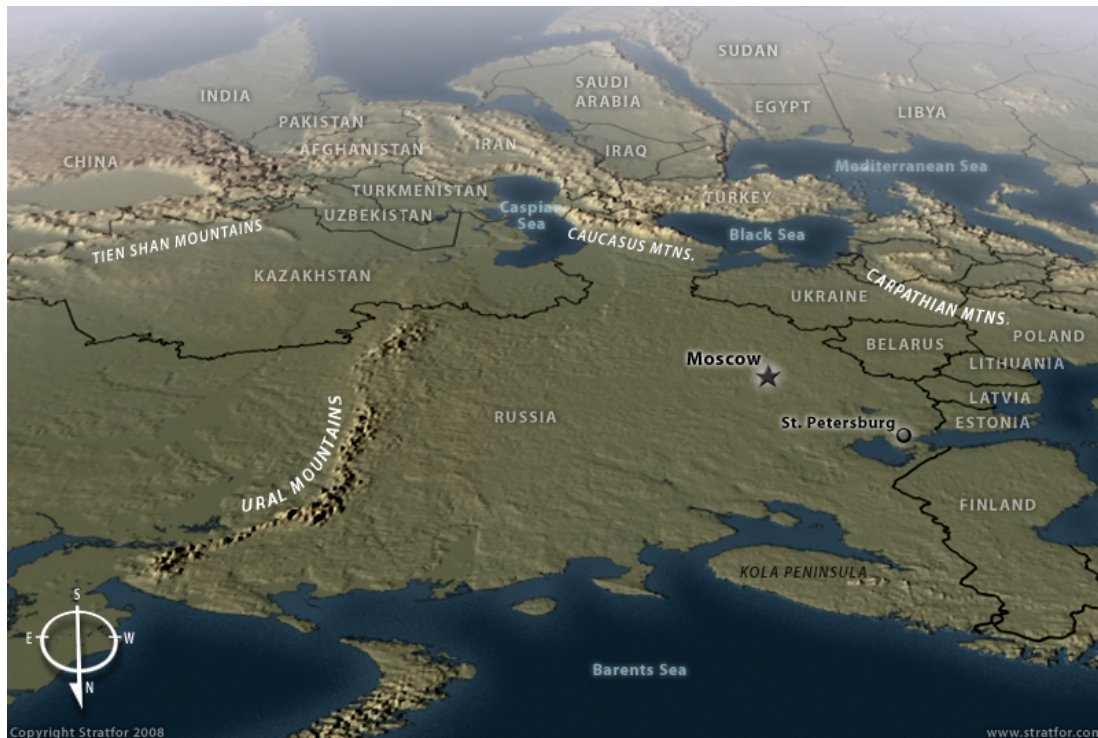
Figure 1. Russian Geopolitical Perspective 18

control as much of the European plain as possible. To the south, Russia's defensible borders depended on the control of the entire Caucasus (control over the Caucasian mountain range from the south) and the Black Sea. See Figure 1.