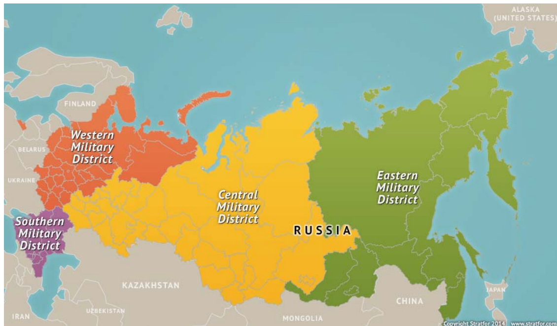
Figure 2. Russia's Military Districts 49

In 2010, a major change in the organization of the Russian Armed Forces occurred—four new military districts were created, instead of the former six; one of them, the SMD, became responsible for the strategic southern and southwestern direction. It united the land and the air forces stationed on its territory as well as the Black Sea Fleet and the Caspian Flotilla. Basically, the territory of the military district includes all the land between the Black and the Caspian Seas, north to the Caucasus mountain range and the northern shores of the both seas, as outlined in Figure 2. 48