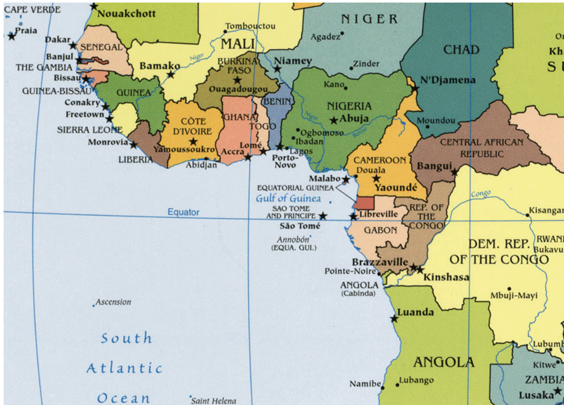
Figure 1. Map showing the Gulf of Guinea and Countries.

Its serenity, largely due to prevailing good weather condition, offers smooth sailing for ships. An attribute that also provides safe haven for pirates in the region. 9