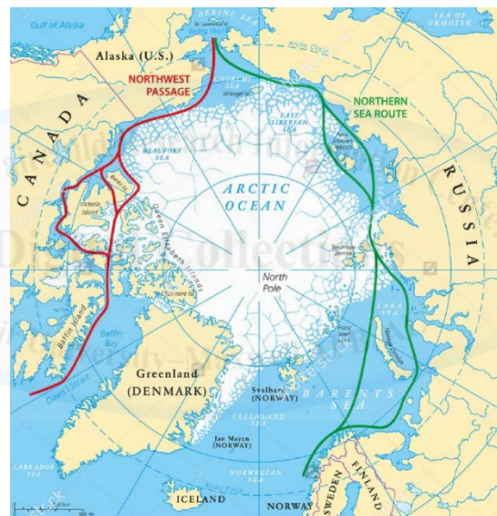
Figure 1 Arctic Sea Routes

CCP's ability to grow the economy and lift the nation from a developing one to a developed one determines the continuation of power. While China's poverty rate significantly dropped since 1990 according to World Bank poverty statistics 28 , a close look at the data shows approximately 27 million Chinese live at or below USD 1.90 per day and more than 152 million Chinese live at or below USD 3.10 per day. Their economy is still not a consumption driven economy, but an export driven economy. As a top exporter, an economical route through the Northwest Passage (NWP) or Northern Sea Route (NSR) would enable China to further grow, or at a minimum, sustain its economic growth. Connecting the east with the west, both routes begin