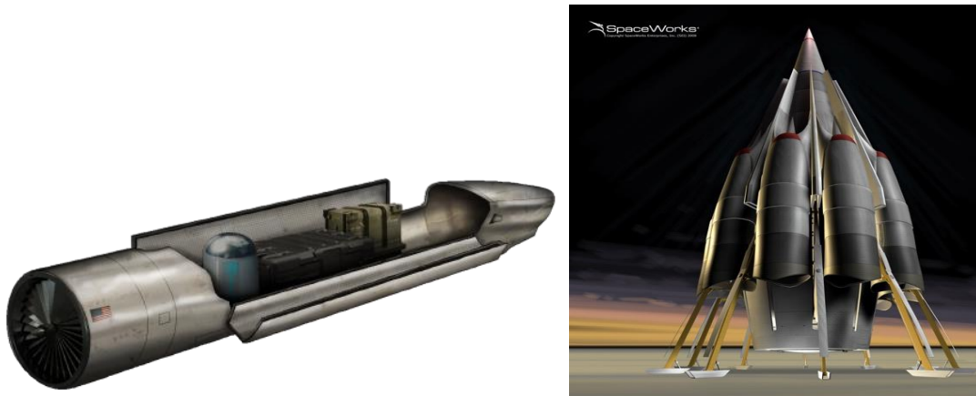
Figure 3 – Artist depiction of Expendable Entry Capsule and its deployment. 25