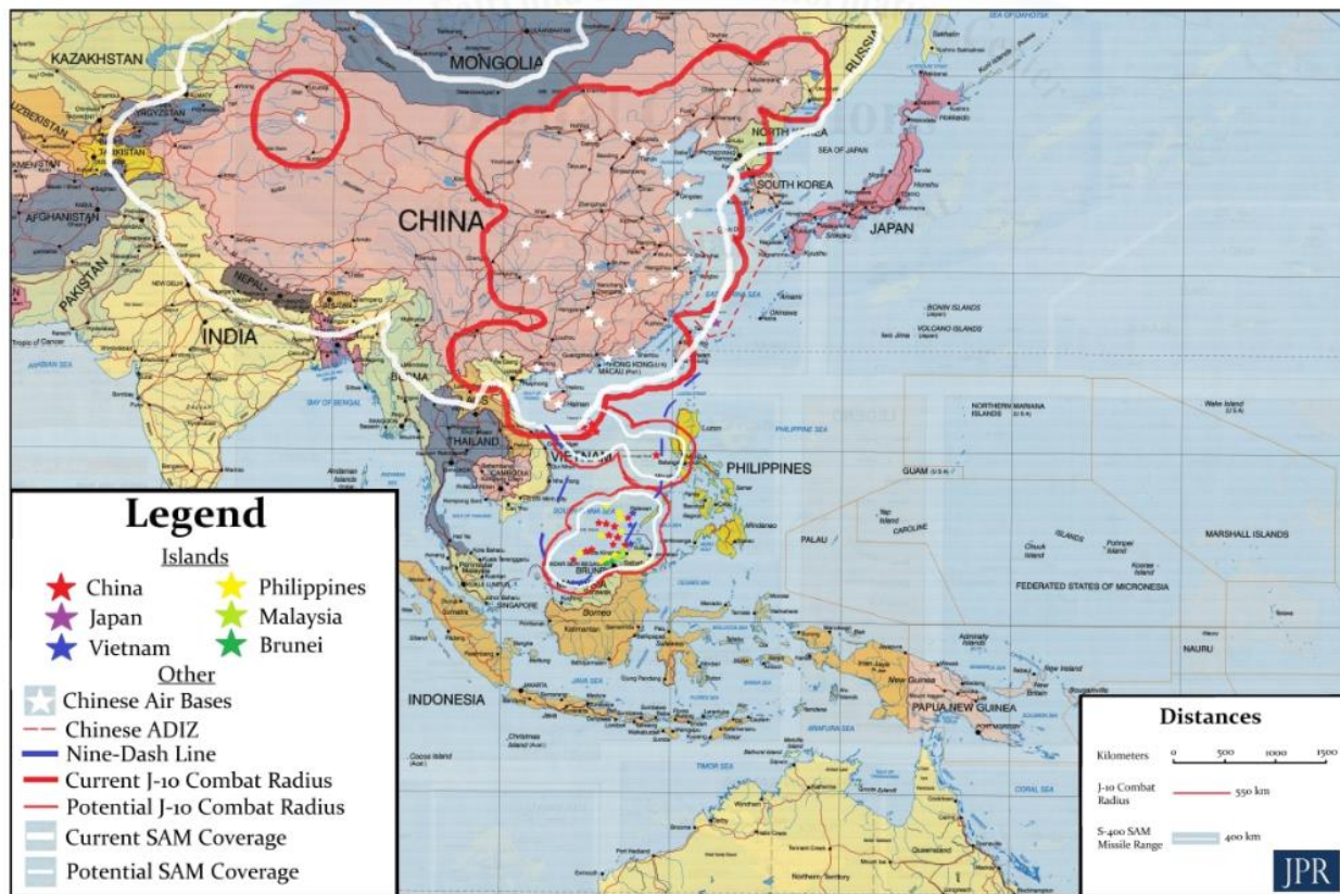
Figure 6-Coverage Expansion from S-400 SAM and J-10 Deployment to South China Sea Airfields 97

A Rapid Global Effects Capability will mitigate China's A2AD environment. It will offer an asymmetric advantage that the Chinese will have to consider in their strategic investments in the future. The Chinese attempt to create a defensive barrier with land-based missiles in the South China Sea is a moot point considering CONUS-based assets.