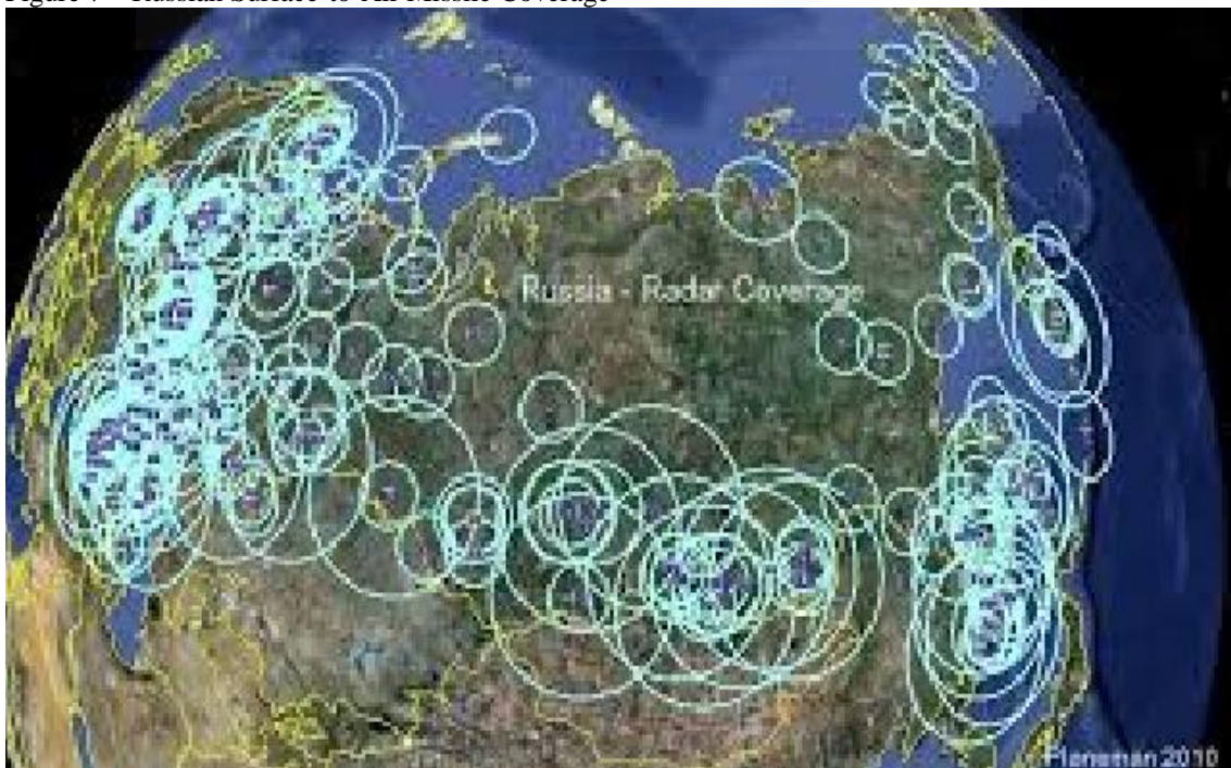
Figure 7 – Russian Surface-to-Air Missile Coverage 103