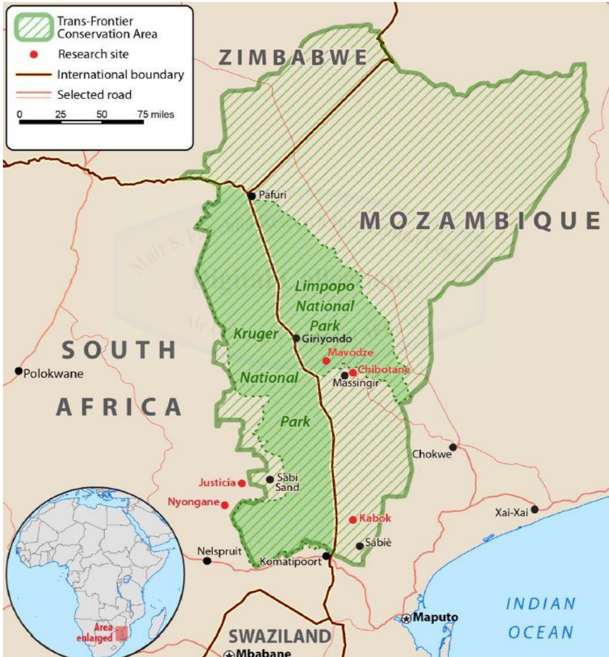
Figure 2: Limpopo National Park with border overlap to Kruger National Park in South Africa 31

through strategic messaging. 29 While these initiatives demonstrate positive steps towards anti-poaching, USAID observed that “not everyone involved in the fight against poaching—from interdiction to prosecution and conviction—understood the full scale and scope of the challenge,” as the lack of successful prosecutions indicate limitations of capacity and capability. 30