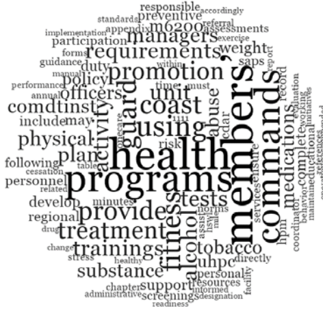
Figure 2. NVivo Visual