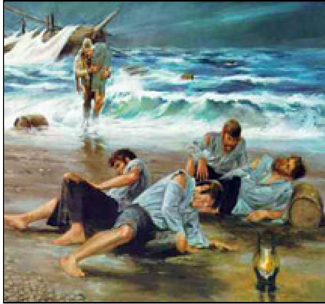
Figure 1. The Priscilla Rescue

Source: Commander Steve Stilleke, ed., COMDTPUB P16100.4, "Hodges Soileau's Painting," On Scene (Summer 2007): 39, accessed May 28, 2016, https://www.uscg.mil/hq/cg5/cg534/On%20Scene/OSsummer2007.pdf .