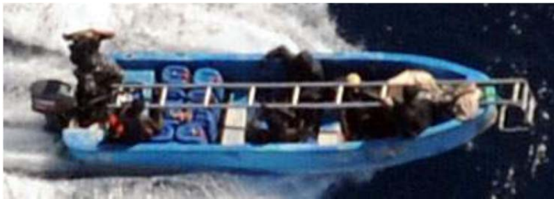
A suspected pirate vessel is located by a Japanese P-3C that then reported the vessel's location to a nearby Danish coalition warship. Gulf of Aden, November 12, 2011.

Ocean in support of America's War on Terror and the Anti-Terrorism Law of 2011, in that the defense minister, with the approval of the prime minister, now had the power to direct JSDF units. Starting in March 2009, JCG personnel operated alongside JMSDF cohorts in the Gulf of Aden under the Anti-Piracy Law and Article 80 of the JCG Law, which delineated the JCG as a paramilitary force due to the practice of bringing the JCG under the Minister of Defense at times of JSDF mobilizations. 107 The decision to send the JCG and the JSDF in this capacity was supported by opinion polls that showed a relatively high general public approval rating of 57 percent in favor of a JSDF response in the Gulf of Aden. 108