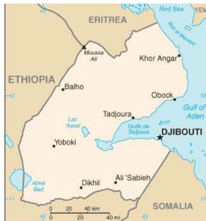
Figure 3. Djibouti. 157

which China donated one of its domestically-built MA-60 turboprop airplanes and one of its WZ551 armored personnel carriers a mere four months later. 154 In early November 2015, General Fang Fenghui, Director of the PLA's General Staff Department and therefore the PLA's top operations officer, visited Djibouti to negotiate the establishment of a Chinese base to be constructed in Obock, an isolated coastal town in the northern part of the country (see Figure 2). In a symbolic gesture, President Guelleh granted permission to this request just one day after U.S. Secretary of State John Kerry's own unprecedented visit, also commenting on the Japanese effort by bluntly saying that "the Japanese want to protect themselves from piracy—and now the Chinese also want to protect their interests." 155 As the United States is paying U.S. $63 million annually to rent the land on which Camp Lemonnier stands compared to the projected rent for the Chinese base of U.S. $100 million, Djibouti has much to gain from serving as the host to global power rivalries. 156