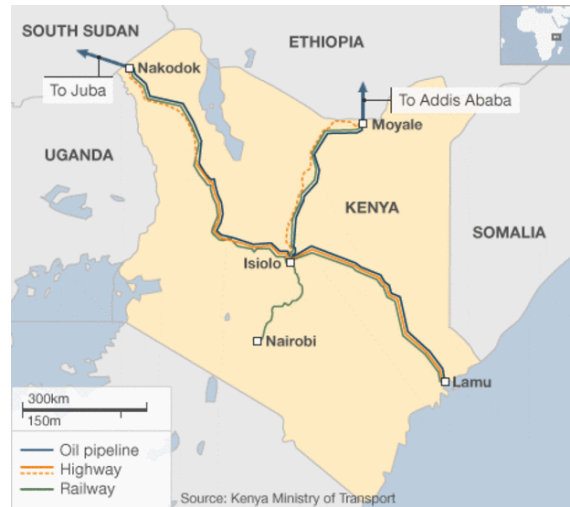
Figure 5. Proposed Pipeline from Juba, South Sudan, to Lamu, Kenya. 209

Kenya, and South Sudan. 207 One of the companies that reportedly bid on this project, according to the Sudan Tribune, was Toyota Motor Corporation, though the bidding price was not disclosed. 208 In any case, Kenya's fortuitous location at a key juncture of East African development has likewise afforded it a high level of interest from China, Japan and the United States.