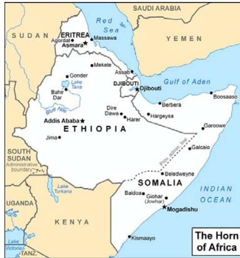
Figure 1. The Horn of Africa. 79

The business of piracy in the region demonstrated itself to not only be a viable but an especially lucrative enterprise: from 2005 to 2013, pirates were rewarded with average annual ransoms of U.S. $53 million. 80 Even more incredible was the often overlooked U.S. $18 billion in annual increased trade costs associated with insurance requirements, altered trade routes, and increased cruising speeds, as well as the U.S. $1 billion to U.S. $1.3 billion in annual military costs associated with anti-piracy efforts footed by the international community. 81 Somalia's giant scale, almost the length of the entire eastern seaboard of the United States, and its porous borders naturally contribute to a lack of governance that pirates can exploit. Mogadishu's continuous effort to build a central regime via the Transitional Federal Government (TFG) also runs counter to the autonomous, decentralized, fluid, and traditional nature of the Somali clan culture. Clans quickly aligned, dissolved, then realigned on numerous occasions to adapt to the rapidly