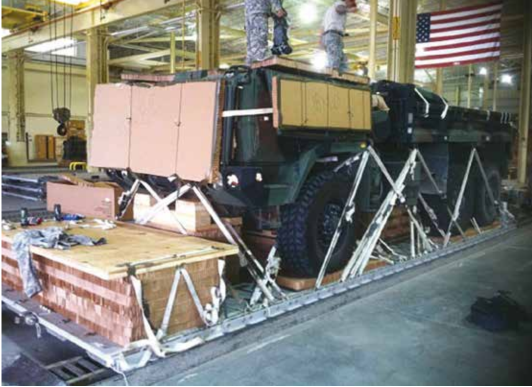
Low Velocity Air Drop rigged at Fort Bragg Heavy Drop Rig Site in North Carolina.