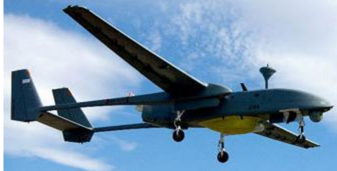
Figure 1. RQ-2 Pioneer

The RQ-2 Pioneer is approximately 14 feet long with a wing span of over 16 feet. It has a maximum take-off load of 450 pounds (RQ-2B variant), and is powered by a 29 horsepower pusher-propeller driven, 2-stroke, twin cylinder, rear mounted engine allowing it to fly at a cruising speed of 92 miles per hour and an employment altitude of 15,000 feet. With approximately 70 pounds of fuel on board, the Pioneer is capable of achieving a mission loiter time up to 6 and a half hours. The flexibility provided in the launch and recovery aspects of the vehicle, allows for both land and sea based operations. On land the system can be launched utilizing a wheeled take-off, a catapult from a pneumatically operated twin rail launcher, or rocket-assisted using the EX 125 Mod 2 jettisonable JATO booster. When launching from naval vessels, the Pioneer vehicle is launched using the rocket assist method to provide the necessary propulsion for take-off from the ship deck. The Pioneer can land on runways using a wheeled landing with a tail hook to catch arresting cables, or by flying into a catch net attached to an energy absorbing system when landing on ships. 16