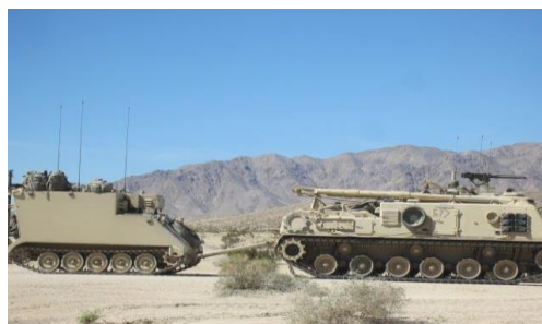
Figure 1-4, M88 Conducting recovery operations during NTC rotation 15-06

While it was a challenge (RECON) ahead of CTCP, it was not elements of the CTCP responsibilities, the focus on security and CTCP during there were instances taken and security was intelligence) to allow