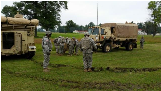
Figure 1-1, Elements of HHT completing break down of CTCP at Fort McCoy, WI

The squadron's ability to conduct sustained reconnaissance and security operations was heavily reliant on the ability for the tactical logistics execution to adequately support the maneuver plan.