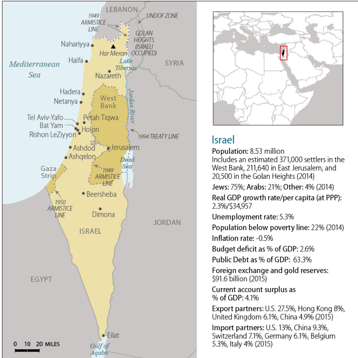
Figure I. Israel: Map and Basic Facts

Sources: Graphic created by CRS. Map boundaries and information generated by Hannah Fischer using Department of State Boundaries (2011); Esri (2013); the National Geospatial-Intelligence Agency GeoNames Database (2015); DeLorme (2014). Fact information from CIA, The World Factbook ; Economist Intelligence Unit; IMF World Outlook Database; Israel Central Bureau of Statistics. All numbers are estimates and as of 2016 unless specified.