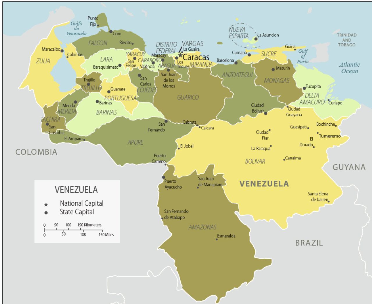
Figure 1. Political Map of Venezuela