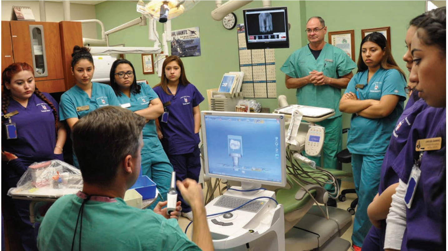
Judson High School Dental Interns in San Antonio, Texas, learn about the digital dental technology Navy dentists are using during a tour of the U.S. Army Budge Dental Clinic, Joint Base San Antonio, Fort Sam Houston, Texas.

Story Courtesy of NAMRU-SA Public Affairs