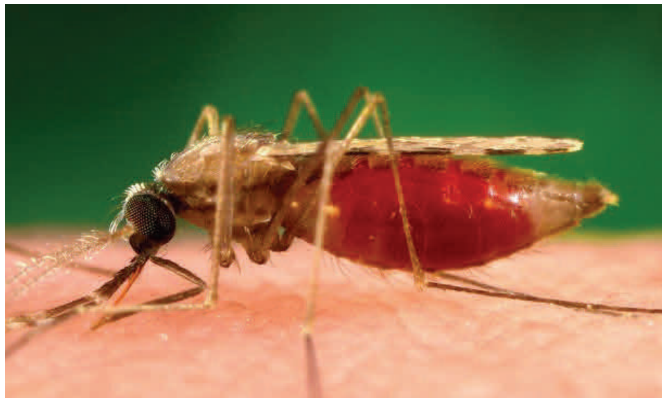
Malaria is a serious and sometimes fatal disease caused by a parasite carried by the female Anopheles mosquito, which bites people.

The World Health Organization estimates that in 2015, 214 million clinical cases of malaria occurred, and 438,000 people died of malaria, most of them children under 5 years of age in Africa. Because malaria causes so much illness and death, the disease is a great drain on many national economies. Since many countries with malaria are already among the poorer nations, the disease maintains a vicious cycle of disease and poverty.