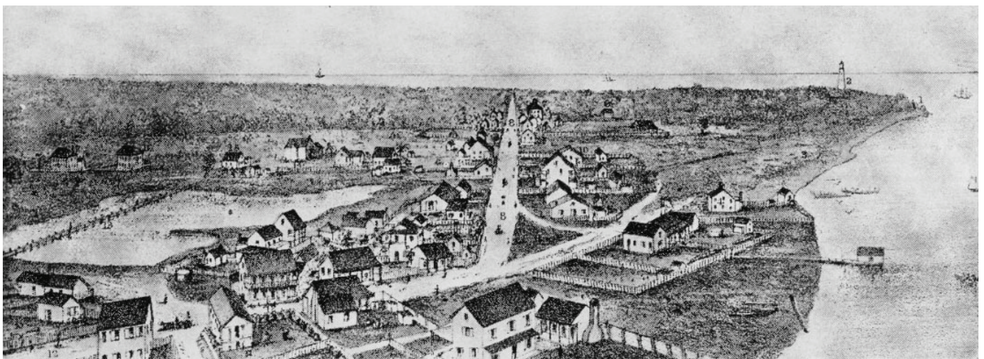
Vintage sketch of Key West, Ca 1830s.