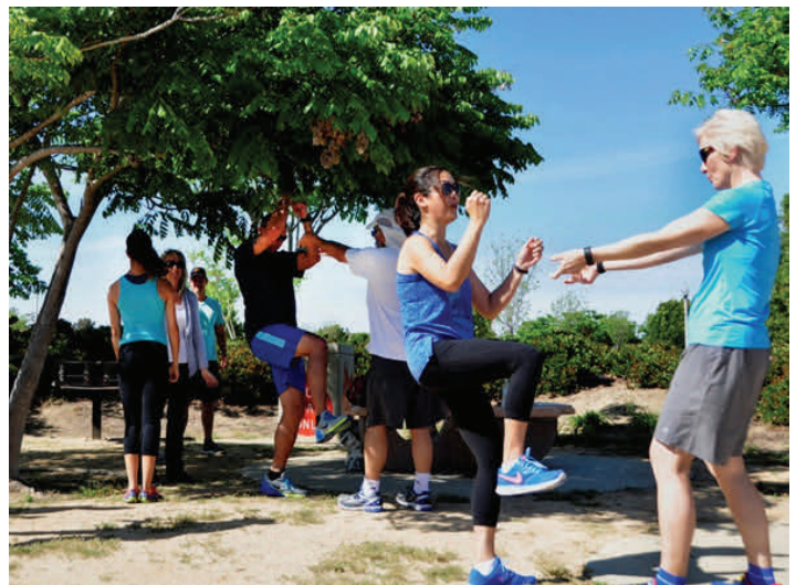
NHRC hosted a self-defense workshop for Sexual Assault Awareness & Prevention Month (SAAPM) to teach men and women at the command skills to fend off an attack as well as how to prevent one. The goal was to help participants be more aware of their surroundings and feel more empowered in everyday situations.

As the DoD’s premier deployment health research center, NHRC’s cutting-edge research and development is used to optimize the operational health and readiness of the nation’s armed forces. In proximity to more than 95,000 active duty service members, world-class universities, and industry partners, NHRC sets the standard in joint ventures, innovation, and translational research.