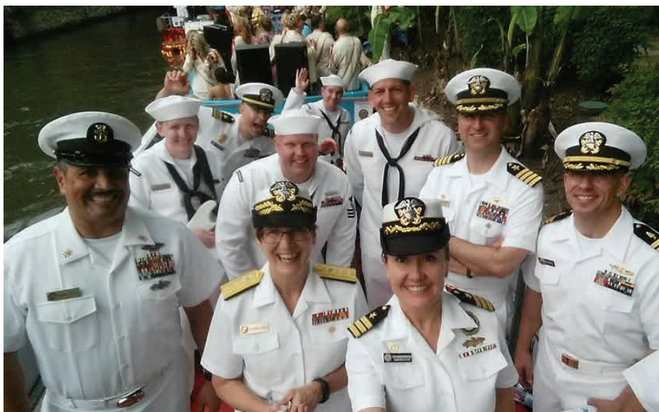
Navy Medicine ambassadors, Navy Band Southeast, and Navy ambassadors from Navy commands based in San Antonio engage the crowds along the San Antonio River walk and reaches hundreds of thousands of television viewers across the nation from their U.S. Military Sea Services float in the 75 th annual Texas Cavaliers River Boat Parade as part of the Fiesta San Antonio.

Fiesta began in 1925 with the Pilgrimage to the Alamo in honor of the defenders of the Alamo who lost their lives in March 1836. It has been held every year since and is recognized as the third largest event of its type in the nation with the televised River Boat Parade reaching hundreds of thousands of viewers across the nation and helping launch the 10-day Fiesta celebration. Fiesta has always had a strong military participation and San Antonio