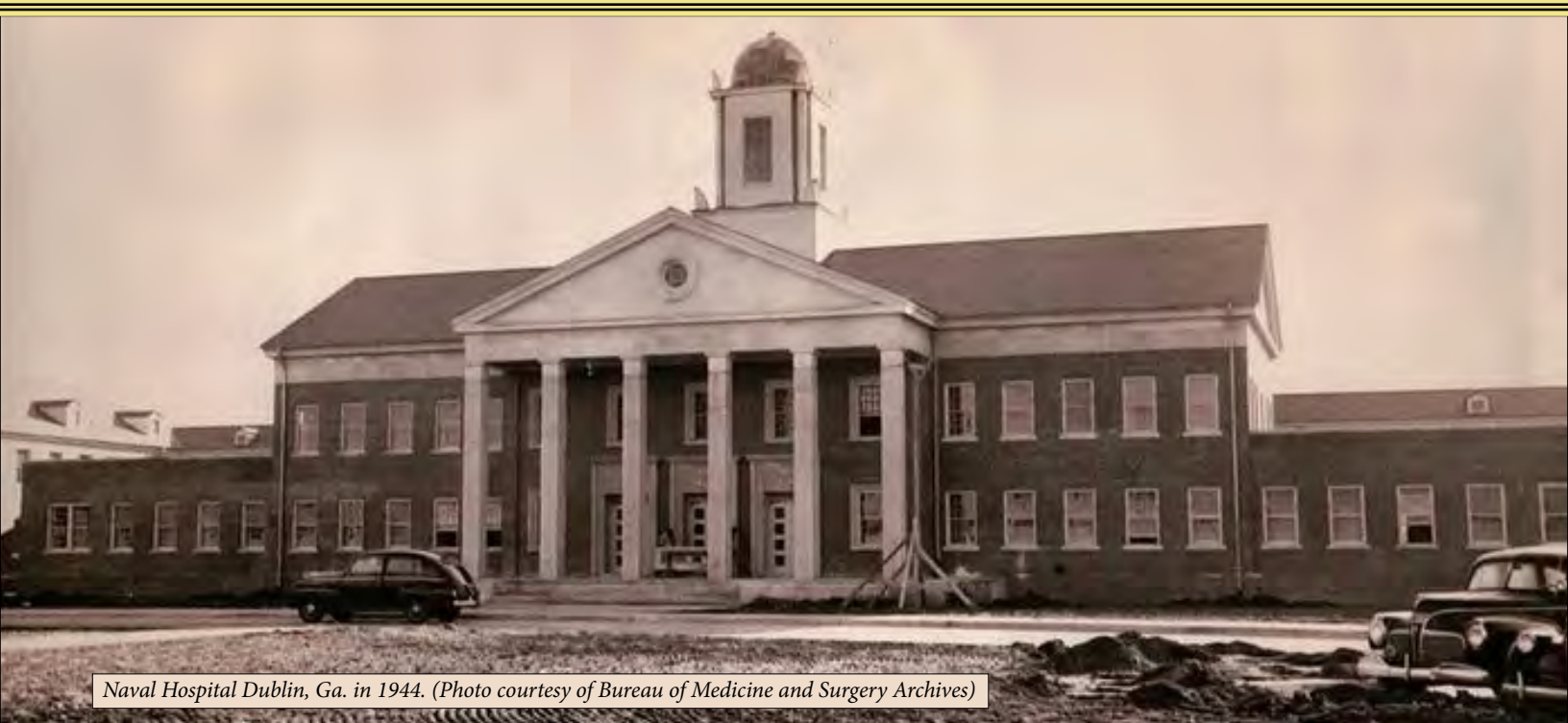
Naval Hospital Dublin, Ga. in 1944.