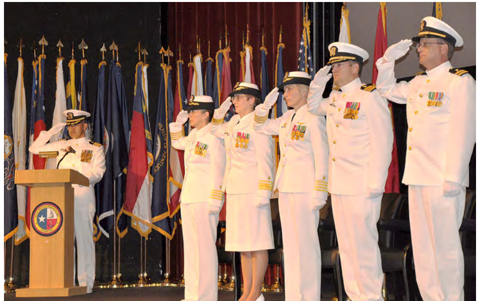
Naval Medical Research Unit-San Antonio was passed to a new commanding officer at a change of command ceremony conducted with great dignity and steeped in U.S. Navy military tradition, at Joint Base San Antonio, Fort Sam Houston in San Antonio, June 5.