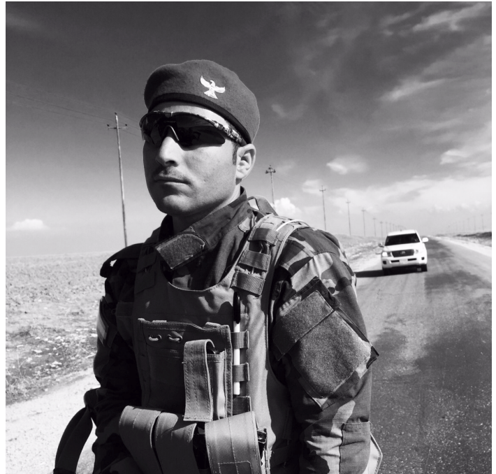
A Yazidi fighter near Mt. Sinjar, Iraq.

The fractured nature of the battlefields on either side of the Iraqi-Syrian border mean that the Islamic State is neither the only