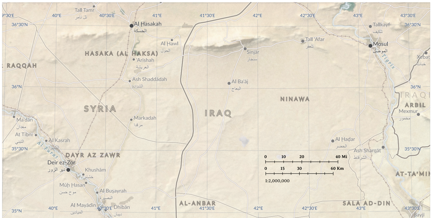
Northern Iraq and Syria