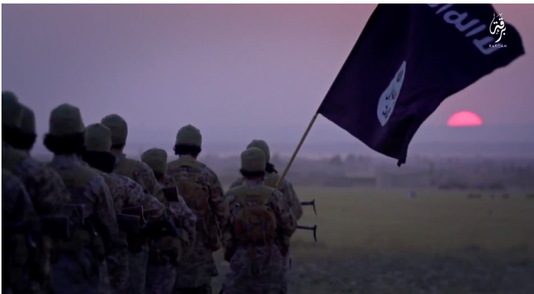
This image from an Islamic State video shows fighters training in Libya.

Although propaganda videos have shown foreign recruits burning their passports, and