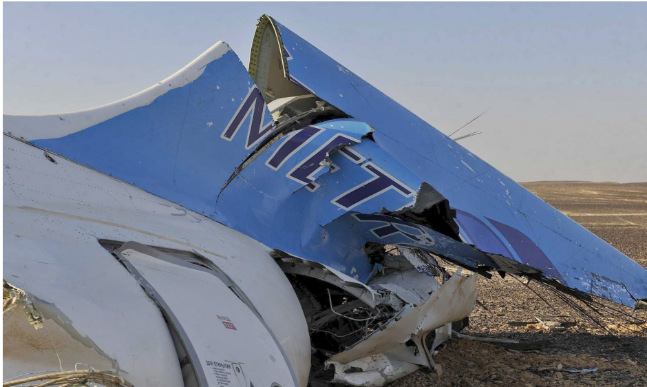
The wreckage of Metrojet Flight 9268