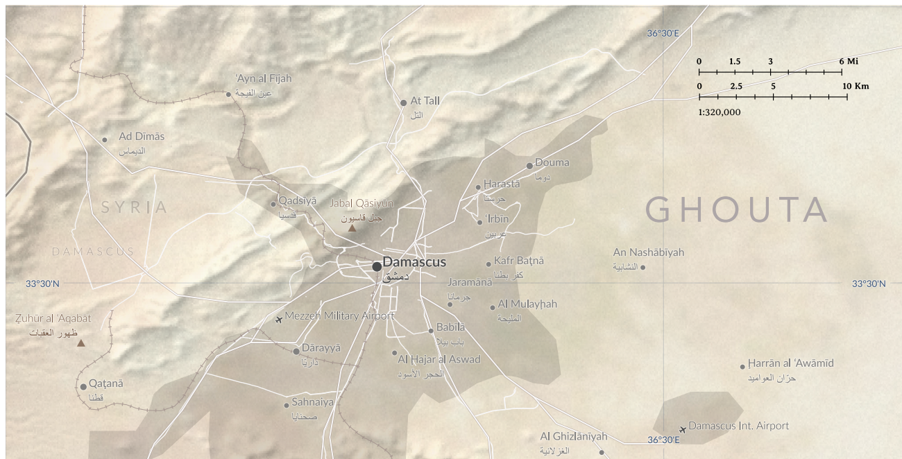
Damascus and environs