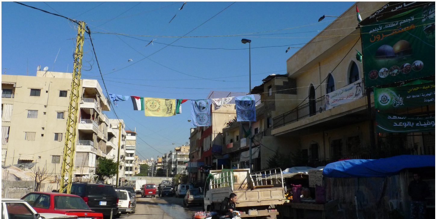
The entrance to Bourj el-Barajneh camp in southern Beirut.