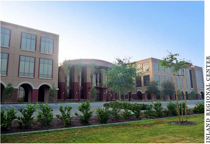
INLAND REGIONAL CENTER