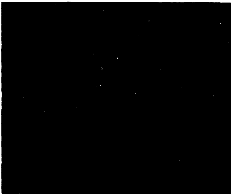
Figure 1. Precipitation Zone Formation by Rabbit Antiserum with Radioisotopic Enterotoxin B. The upper row of wells contains polyvalent antiserum prepared with 20% pure enterotoxin, the middle row plus the wells at the extreme top and bottom of the figure contain the enterotoxin, and the lower row contains monovalent toxin-specific antiserum.

The purified toxin was exposed to antiserum from rabbits immunized with a toxin preparation of 20% purity according to the technique of Ouchterlony. 8 A single antigen-antibody line was observed in the presence of enterotoxin concentrations up to 1 mg/ml, which was identical to the precipitin line formed with monovalent antiserum (Fig. 1).