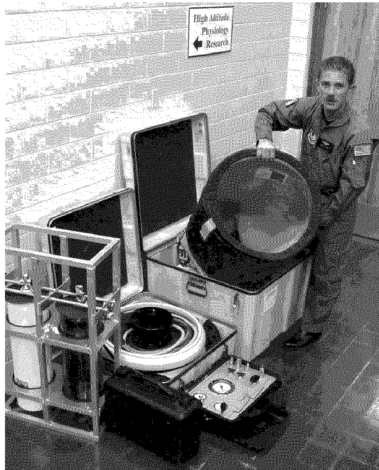
Fig. 2. Containerized EEHS and components

All the aforementioned tasks included a thorough inspection of the system at least prior to and following each challenge. Often, intermediate inspections were conducted during the challenge to assess pressure and integrity of the system to the challenge. Finally, to complete the assessment, and in compliance with PVHO-1 requirements, a free and unbiased inspection of the material quality assessment plan, manufacturing operations and quality control assurance was performed.