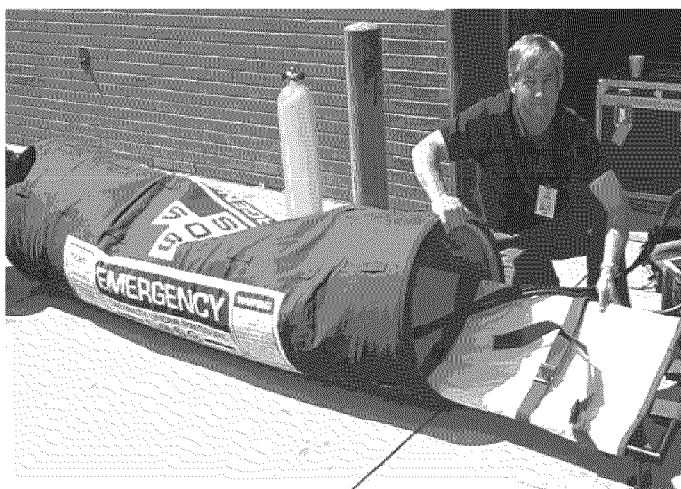
Fig. 3. EEHS Extended Ready for Patient Ingress

Finally, and an equally important adjunct to the static aeromedical evaluation tests mentioned above, was the airborne performance evaluations and analysis of the EEHS for placement, security, fit and function for several airframes. Principal among these evaluations included detailing methods for in-flight security of the system for safe travel and for emergency conditions including air turbulence and in-flight emergencies. Also, another important assessment of this task was to exercise the patient/operator communications issues in the noisy aeromedical transport environment. The comprehensive results of this evaluation are contained in a Technical Report composed by the executing agency (4).