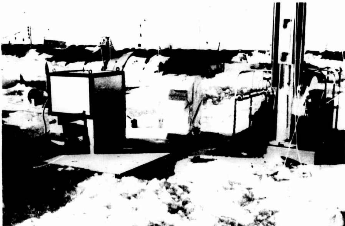
Figure 3. General view of the equipment: Inverter (left); Control consol (middle); Winch platform with tower (right).