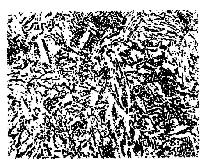
No. B171: X1000 Picral Structure similar to tempered bainite associated with fine carbides and ferrite patches.