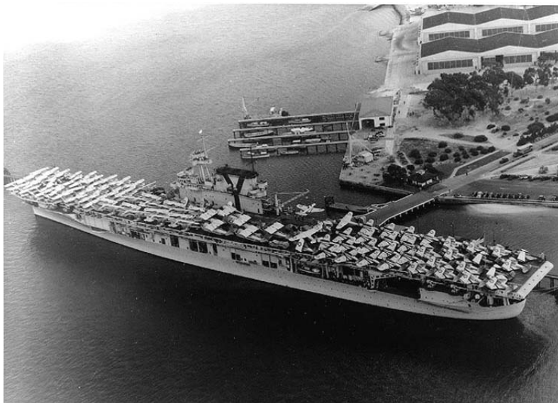
Figure 1: USS Yorktown (CV-5), at Naval Air Station, North Island, San Diego, California, in June 1940: Three Torpedo Squadron Five (VT-5) TBD-1s at the after end of the flight deck are painted in experimental camouflage schemes tested during Fleet Problem XXI.

The last Fleet Problem, XXI, took place in 1940, in the Hawaii area. It consisted of two exercises devoted to refining such points of carrier warfare as coordination and planning of scouting and screening.