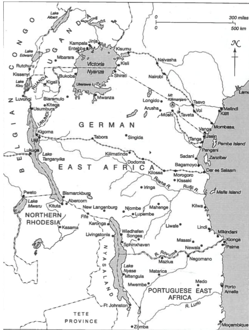
Figure 5. German East Africa in 1914