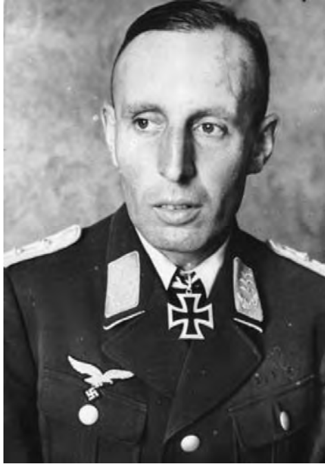
Figure 8. Friedrich August Freiherr von der Heydte