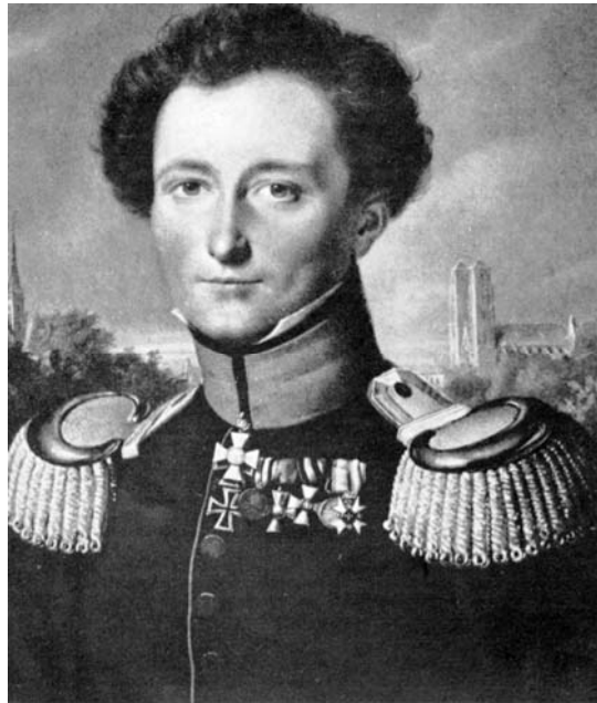
Figure 2. Carl von Clausewitz

It may be argued that Carl von Clausewitz (Figure 2) is the most preeminent military theorist of all time. A short review of his life reveals an impressive military and intellectual background, which formed the foundation of his written work. Clausewitz served in the Prussian Army as France evolved from revolutionary state into the most dominant land power on the European continent. Fueled by mass conscription and the skillful leadership of Napoleon Bonaparte (1769–1821), France’s increased military might was equally matched by its political and territorial ambitions. 70