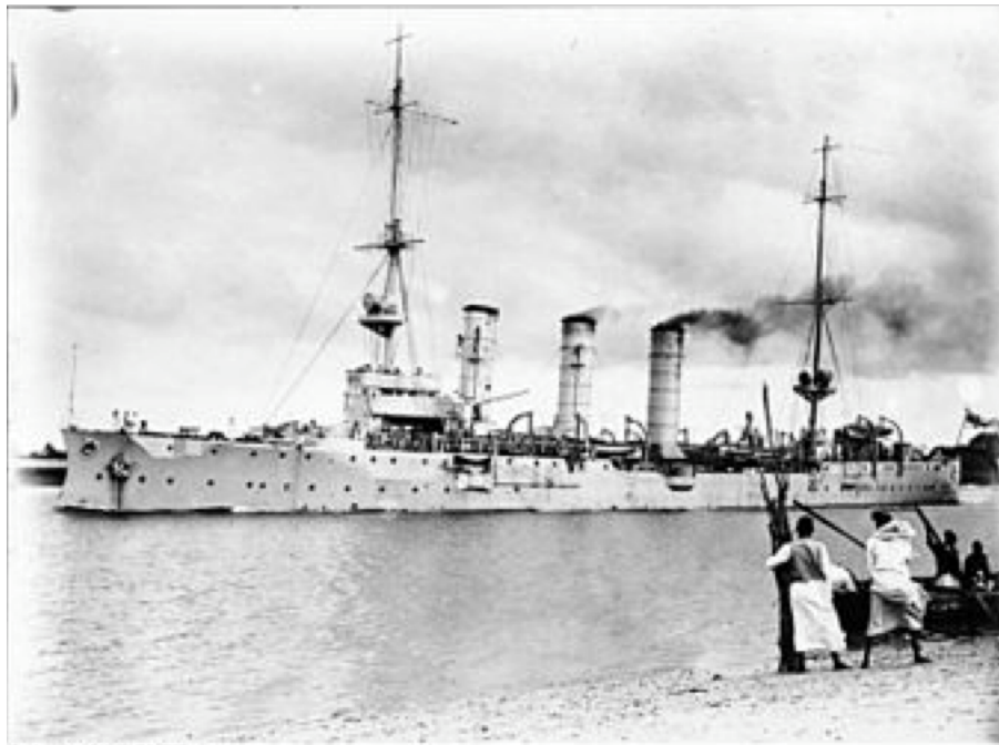
Figure 6. The SMS Königsberg

Figure 6). 129 Once there, environmental obstacles unique to the delta blunted the British ability to destroy the cruiser until July 1915. At that point, her German crew abandoned and sunk the Königsberg using a torpedo warhead. 130 But the Schutztruppe had managed to salvage all ten of the cruiser's 4.1-inch naval guns for use in future land operations. 131 Phase I also included fighting on Lake Victoria and Lake Tanganyika, both of which the Germans would eventually abandon under pressure.