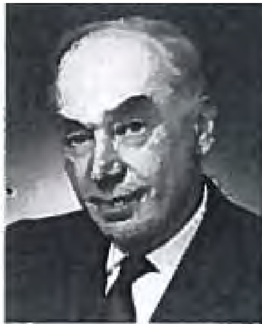
Figure 9. Otto Heilbrunn

Although often viewed in terms of large-scale, industrially driven, state-on-state conflict—think World Wars I and II—the twentieth century also witnessed many irregular warfare campaigns. World War II, in fact, was the first war in which “[t]he entire rear area was thus recognized as a theatre of war for sustained operations by soldiers and civilians”—a theatre tasked to partisans and Special Forces. 316 At the time, rear area activity included airborne operations, sabotage, supply to resistance movements, and general partisan warfare, but remarkably, “[n]o clear pattern evolved for the conduct of the war in the rear.” 317 It was precisely this problem that attracted the interest of German author Otto Heilbrunn (1906–1969; Figure 9). 318