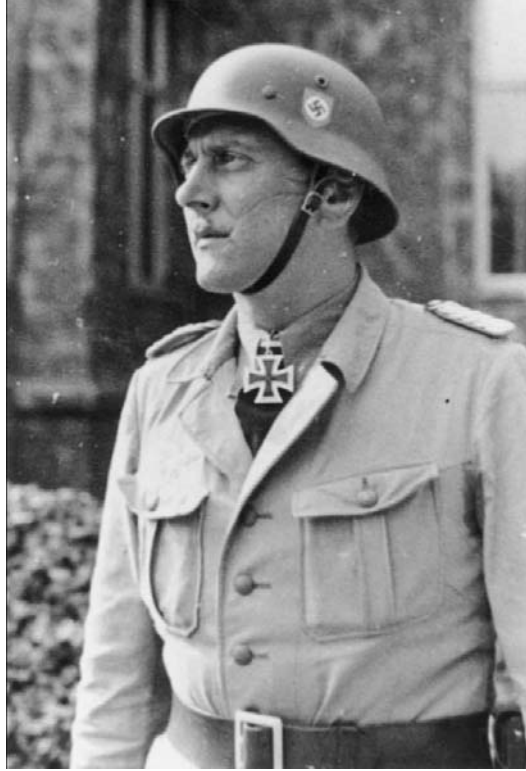
Figure 7. Otto Skorzeny