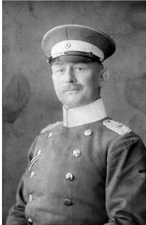
Figure 3. Paul Emil von Lettow-Vorbeck

enemies any loss of personnel or war material worth mentioning?” 122 Von Lettow’s civilian authority was GEA Governor Dr. Heinrich Schnee. Schnee wanted more than anything to avoid colonial conflict, in order to preserve economic development and prevent an African uprising. 123 World War I began on July 28, 1914, when Austro-Hungary declared war on Serbia.