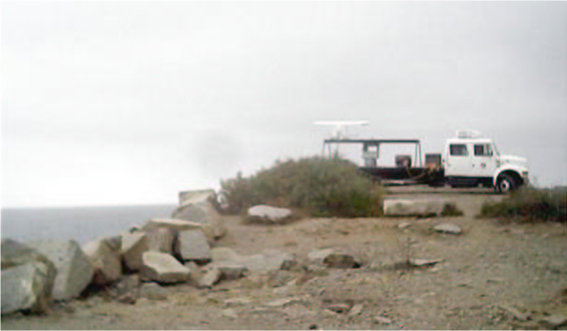
Figure 1: Testing of modified marine navigation radar for NCEX on Cape Ann, MA.

have since have concentrated on the development of the two wave-mapping Doppler radar systems and on preparations for the NCEX experiment.