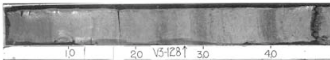
Figure 3. A Scanned Image of an Earlier, Black and White Photographed Core [Core taken off the Research Vessel VEMA in 1954. Note the sharp “color” variations clearly visible even in this black and white image.]

Many of these uses of color change can be applied to the black and white glossy photos of the older cores, especially in the selection of sample intervals and grey scale (Figure 3). Having all of these core photos scanned and digitally available for researchers is our most recent objective.