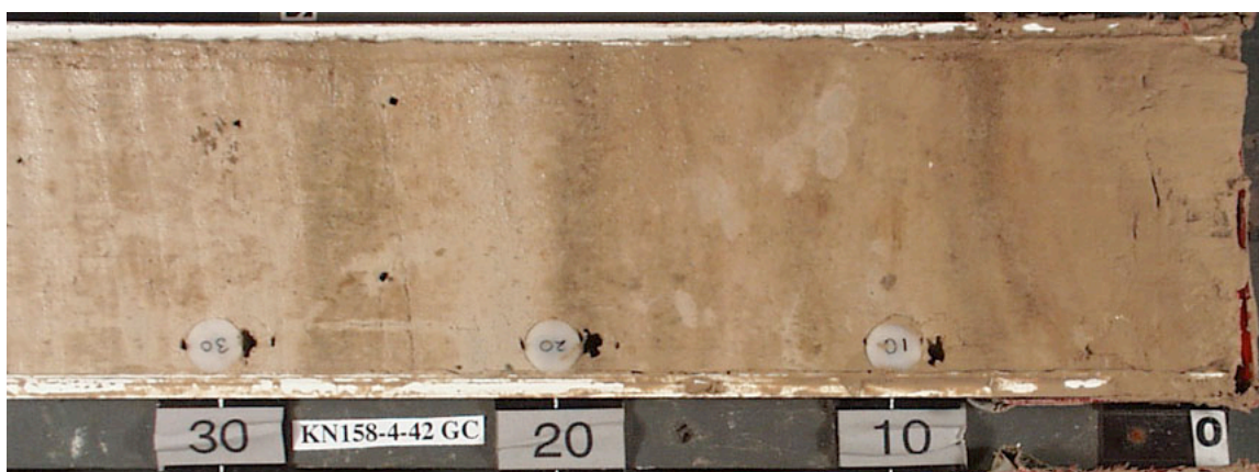
Figure 2. Digital Color Image of Newly Acquired Core [Core taken off the Research Vessel KNORR in 1993. The color variations are evidence of changes in chemical composition and, to some extent, physical properties in the cores. These color changes can be research tools in themselves, or used as a guide for sampling the sediment.]

Sediment color and texture reflects chemical composition and, to some extent, physical properties of the sediment (Figure 2). Color scanning, color reflectance and color spectometry have become important tools for researchers. Changing colors in cores from the Cariaco Trench were used to