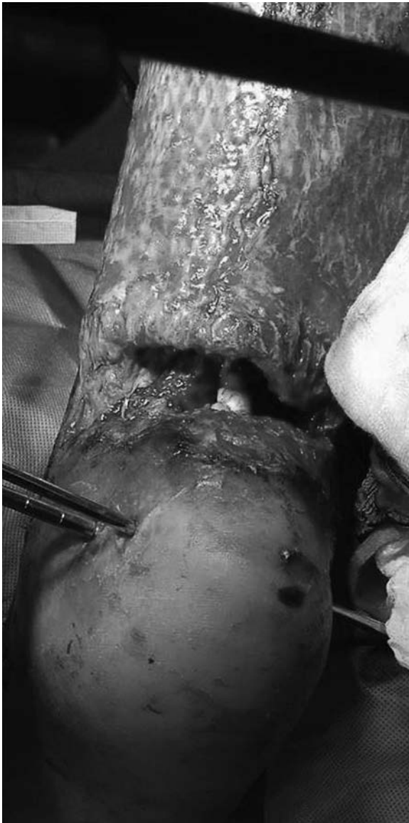
FIGURE 2. Free flap partial flap necrosis.

Definitive soft tissue coverage with a free or rotational flap was performed after an average of 20 days after initial injury with no difference between cohorts. There was no difference in complications or failure rate with respect to timing of the coverage procedure (Table 4). In subgroup analyses, however, the rotational flaps performed after 14 days had a significantly lower reoperation rate (24%) than free flaps performed after 14 days (57%; P = 0.03 ). Finally, there was a significant increase in failure rate and reoperation rate in Orthopaedic Trauma Association Type C fractures treated with a free flap. Type C fractures treated with a free flap had a 38% failure rate and a 75% reoperation rate compared with a failure rate of 6% ( P = 0.04 ) and a reoperation rate of 31% for extremities treated with a rotational flap ( P = 0.04 ).