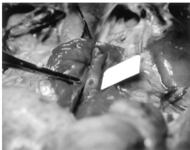
Fig. 2. Photograph of the FD postmortem. The tip of the forceps is pointing to the 4.4-mm hole that can be seen through the thin polyglactin backing. The FD completely adheres to the outer aortic wall and surrounding tissue.

The FD developed by the American Red Cross and the U.S. Army consists of powdered fibrinogen, thrombin, factor XIII (all of human origin), and calcium on a 4 × 4-inch polyglactin (Vicryl) backing. 13 Thrombin plays a pivotal role in the coagulation cascade by converting fibrinogen to fibrin.