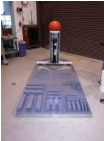
Figure 3. Laser subsea test frame assembly (without cone target) [The frame is 3 meters long by 1.2 meters wide. The vertical acoustic release assembly is at the opposite end with an orange recovery float directly above the acoustic release.]

The test frame was constructed of 3" box aluminum and plastic (PVC) test panels that were painted gray to provide the required reflectance properties. The assembly was deployed and recovered using acoustic releases that negated the use of SCUBA divers.