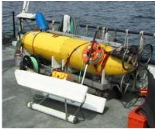
Figure 2. ROVEX with ROBOT payload [The Laser imaging sensor ROBOT as an AUV payload connected to the autonomously guided underwater vehicle ROVEX. The white surface communications tow float is shown in the foreground.]

ROVEX will be used to support the investigation of the following sensor issues: