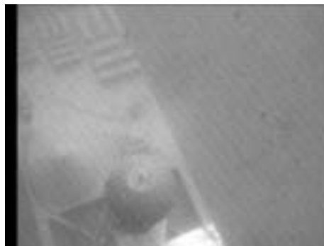
Figure 4. Underwater image of the laser test frame assembly [Recorded by the ROVEX supporting the laser scanner ROBOT at an altitude of 3 meters with natural light 30 minutes after sunrise. The test frame was located in 12 meters of water with a water turbidity corresponding to C \approx 0.45 \text{ meters}^{-1} .]

The laser scanner ROBOT was assembled and installed into a 21-inch (53 cm) payload that was successfully integrated with ROVEX. ROVEX was upgraded as detailed under the Work Completed section of this document. The ROVEX-ROBOT assembly was successfully operated in Tampa Bay and in the coastal waters off of Indian Rocks Beach (near Tampa Bay). Figure 4 is a still captured from video collected subsea by the subsea digital video recorder package receiving composite (NTSC) video from ROBOT's CCD video camera.