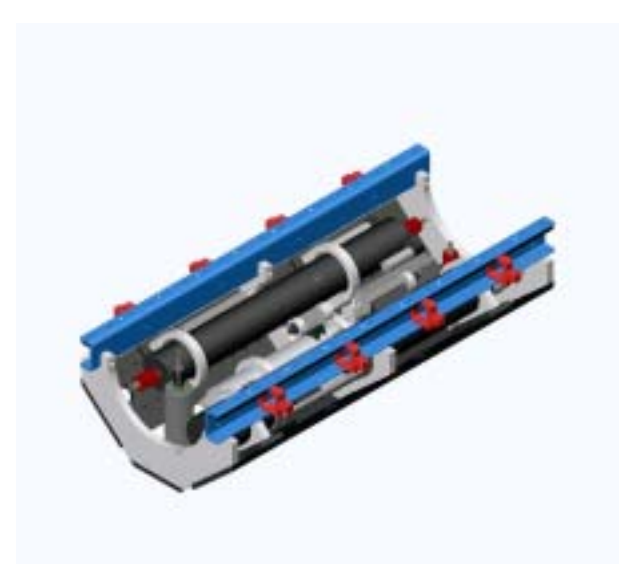
[Exploded view of payload mid-section of AUV, showing sensor layout]