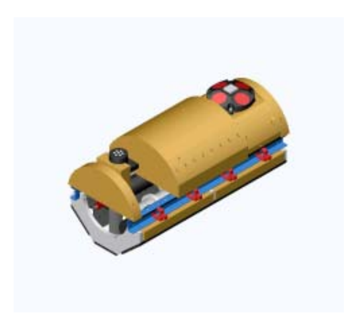
Figure 1. Payload mid-section of AUV