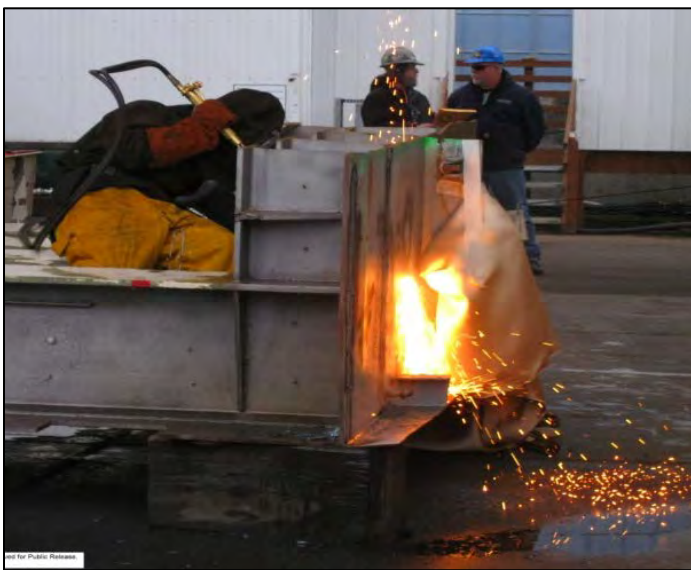
Figure 2: Opacity comparison testing oxy-fuel cutting of deck section.

Although the gasified fuel alternative was reported to reduce particulate emissions, it was not known whether actual opacity would be lower than that of propane metal cutting technologies. To make this determination, the alternative fuel was compared side-by-side with propane at PSNS&IMF (see Figure 2). The demonstration evaluated the alternative fuel on the following criteria: 1) Cutting speed vs. propane; 2) Less than 20% opacity; 3) Opacity levels vs. propane; and 4) Operation cost vs. propane.