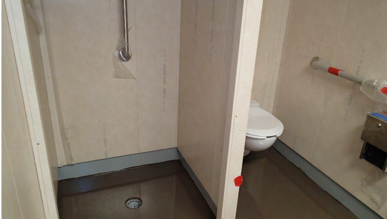
ADA Head Deck prior to finish coat