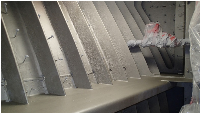
Bow Thruster Room – Port and Starboard