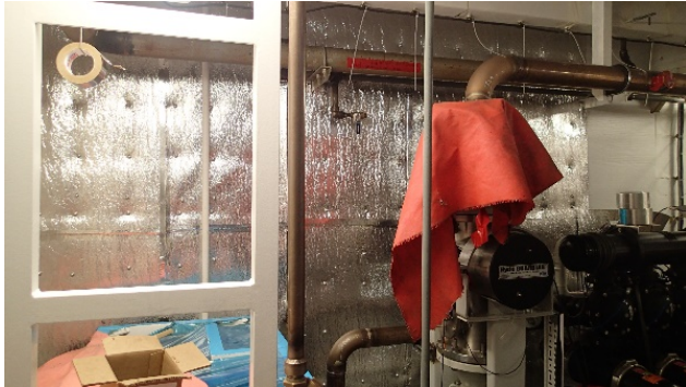
Upper Machinery Space, Aft Starboard Bulkhead with Quad-Zero