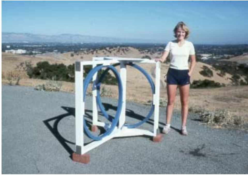
Figure 3. The two ELF antennas (the blue coils) used in the Stanford radiometers. In practice they are covered by a wooden (non-magnetic) windshield structure.

Over the last few years the Stanford radiometer group has carried out a number of extensive analyses of the ELF/VLF data to obtain new information on subjects as diverse as (1) the diurnal and seasonal variations of the noise, (2) the locations of the principal sources of ELF noise around the world, (3) how global change might be reflected in changes in global lightning and thunderstorm activity, and (4) the best theoretical models describing ELF/VLF noise. In addition, a first experimental test of the theory of propagation of ELF radio waves at large distances from the source was carried out using measurements on signals from a Russian ELF (82 Hz) transmitter.