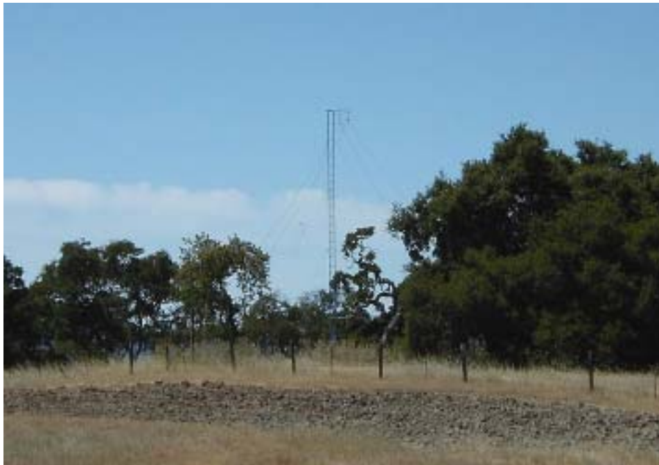
Figure 2. The VLF antennas for the Stanford University radiometer; they are installed in a remote section of the campus. The ploughed area in the foreground is a firebreak.

We have built up an extensive database of ELF/VLF noise measurements extending back to 1985 and it is probably true to say that there is no comparable database of low-frequency radio noise measurements available elsewhere. Since most of our original data acquisition goals have been achieved, only three of the original eight ELF/VLF radio noise measurement systems installed around the world at the start of this project are currently being maintained in continuous operation (Stanford, USA, Sondrestromfjord, Greenland, and Arrival Heights, Antarctica (see Figure 1)); four others (Kochi, Japan; Dunedin, New Zealand; Grafton, New Hampshire; Thule, Greenland) remain in place and are operated intermittently during particular short-term measurement programs. The Stanford and Arrival Heights radiometer measurements continue to extend what are now two uniquely lengthy collections of ELF/VLF noise data.