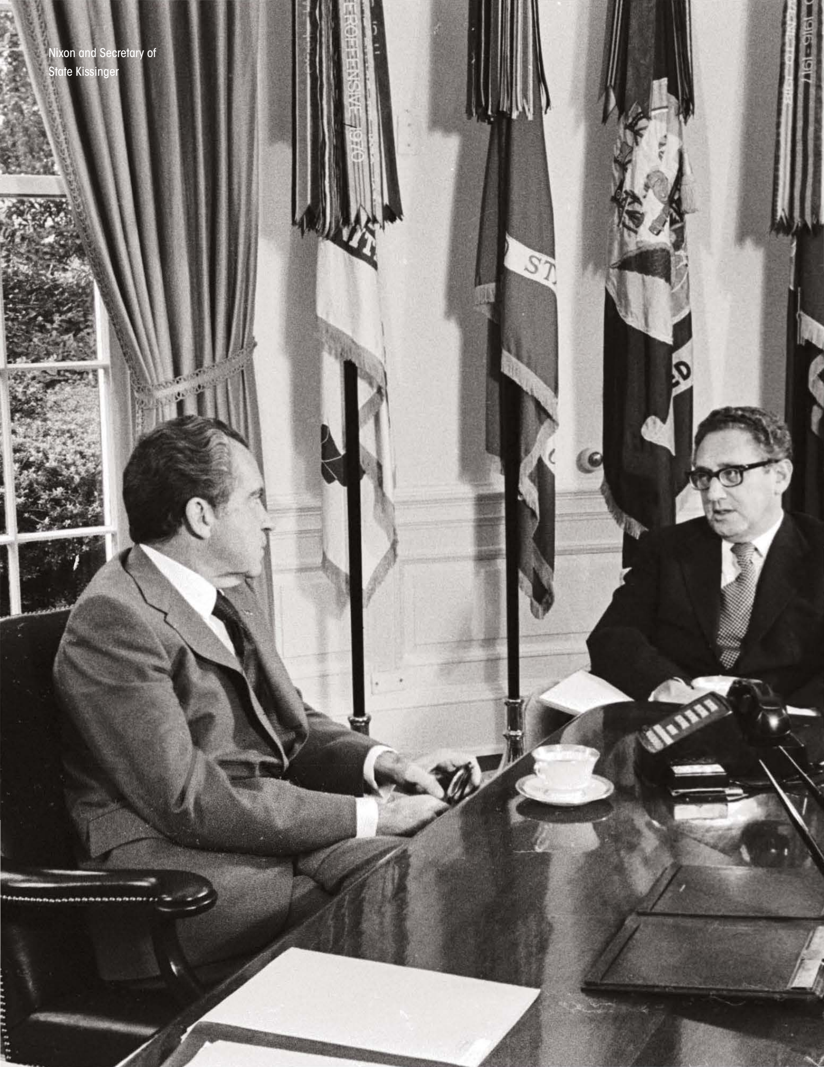
Nixon and Secretary of State Kissinger