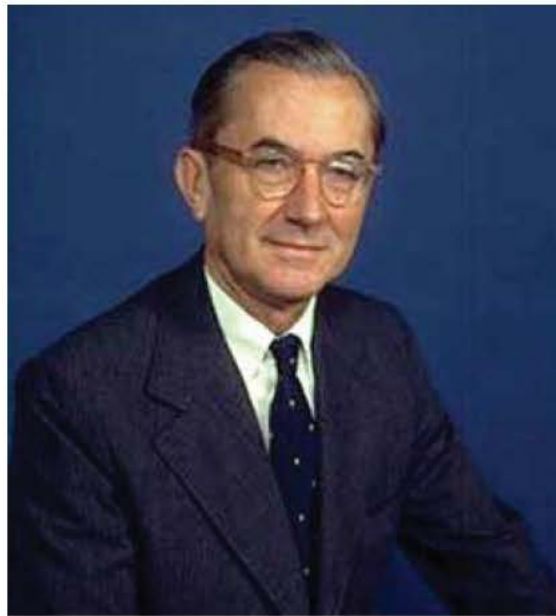
RIGHT: DCI William E. Colby

their staffs. Another function of the METF was to coordinate the large number of taskings levied on the Agency during the crisis, making sure that all taskings were delegated to the proper offices and analysts, and then tracked to make sure the assignment was completed on time.