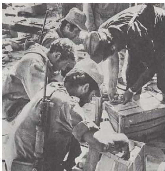
RIGHT: Israeli Troops inspect supplies for Egypt's encircled Third Army

Lehman called early in the morning to say that the DCI had ordered up a paper on the capabilities of the IC to monitor a cease-fire. Analysts from OCI and OSR were called in to work on the paper (along with reps from the DS&T). A paper on the limitations of photography in monitoring a cease-fire was completed by the end of the day and was typed up during the night to be held for the DCI in the morning.