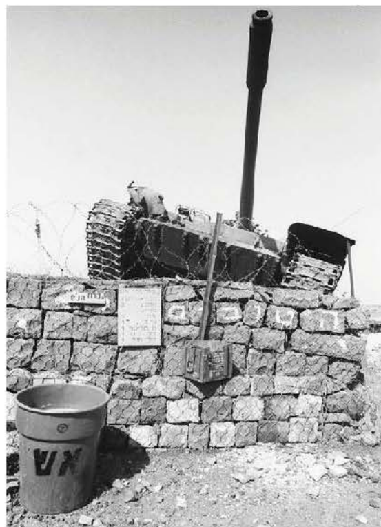
LEFT: Destroyed Syrian tank on the Golan Heights