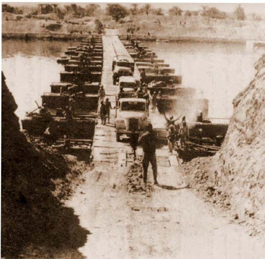
ABOVE: Egyptian forces cross the Suez Canal, 7 October 1973

The weight of evidence indicates an action-reaction situation where a series of responses by each side to perceived threats created an increasingly dangerous potential for confrontation. . . . It is possible that the Egyptians or Syrians, particularly the latter, may have been preparing a raid or other small-scale action. 12