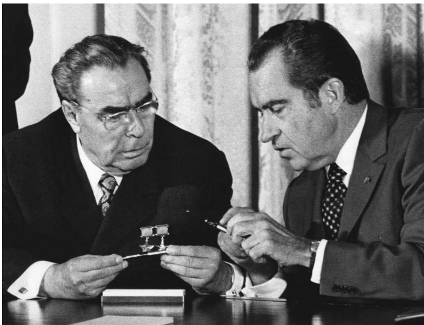
TOP: Soviet leader Brezhnev and President Nixon