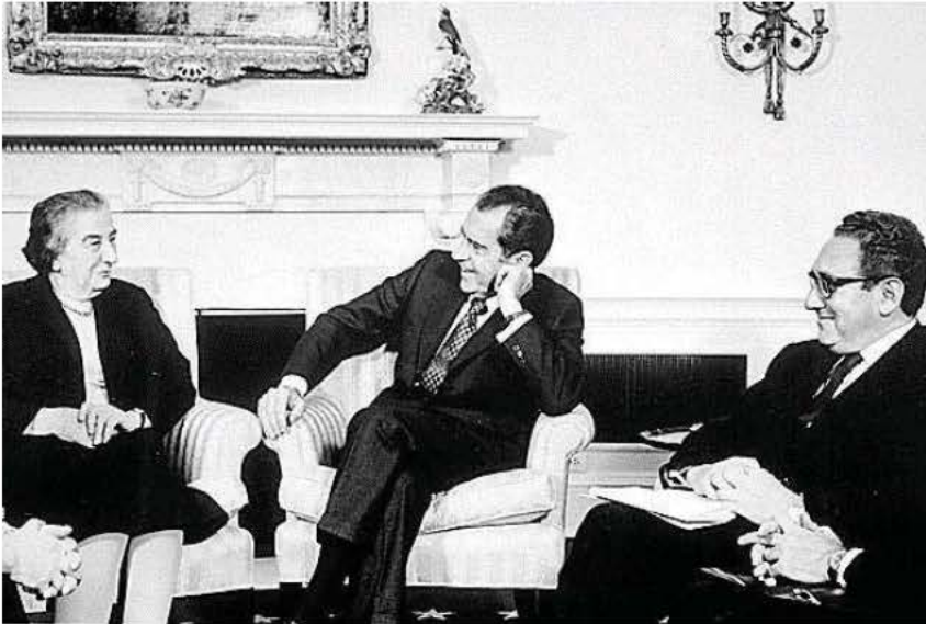
BOTTOM: President Nixon meeting with Arab Foreign Ministers at the White House, 17 October 1973