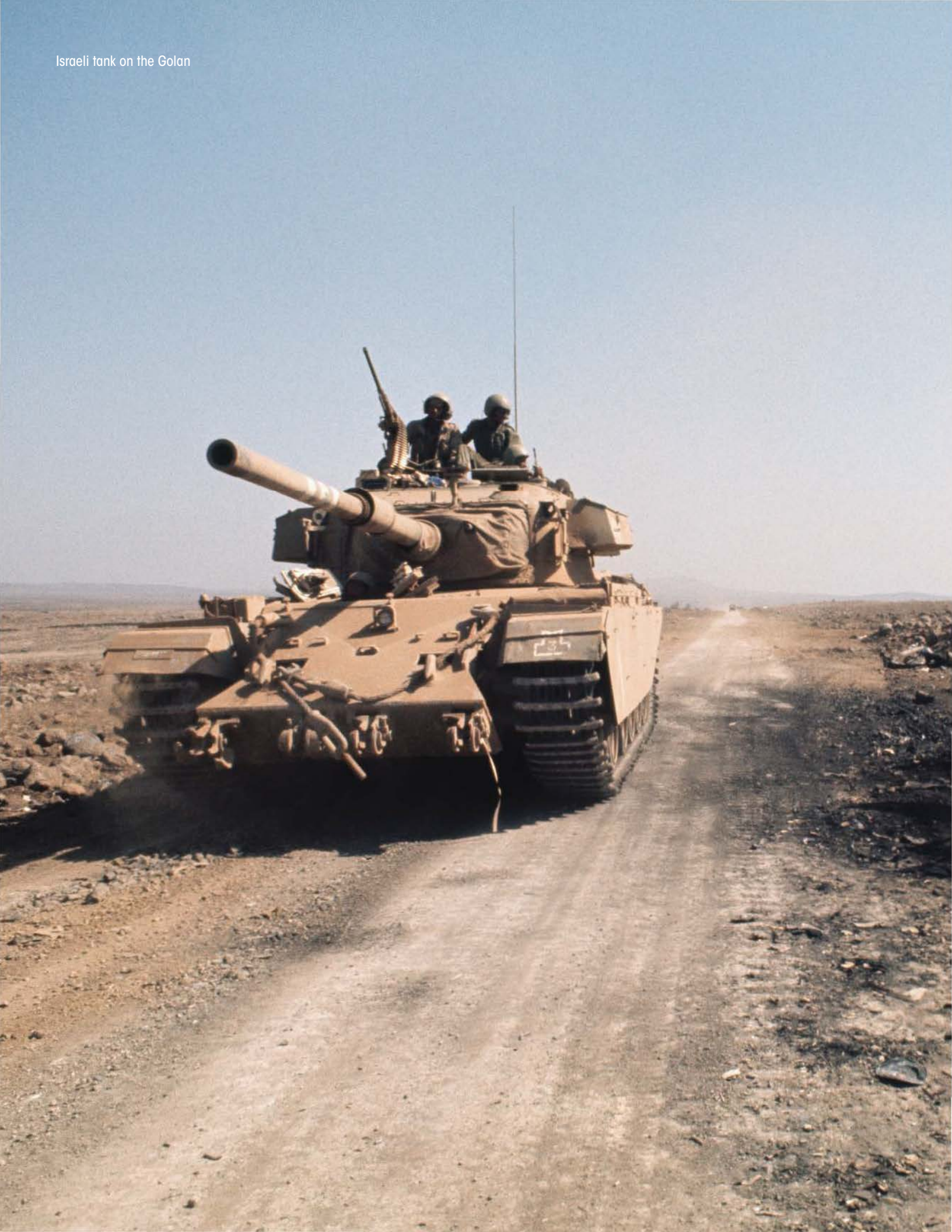
Israeli tank on the Golan