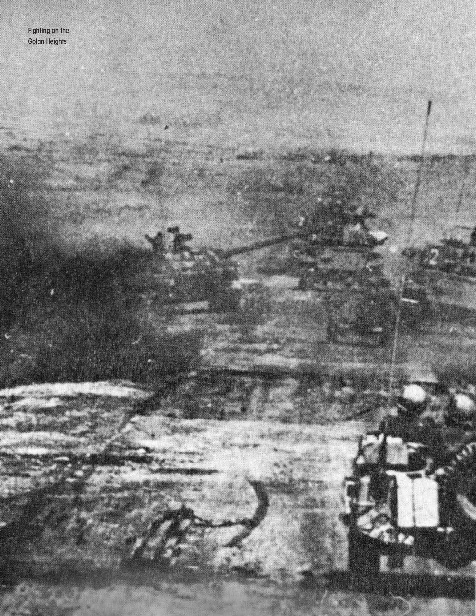
Fighting on the Golan Heights