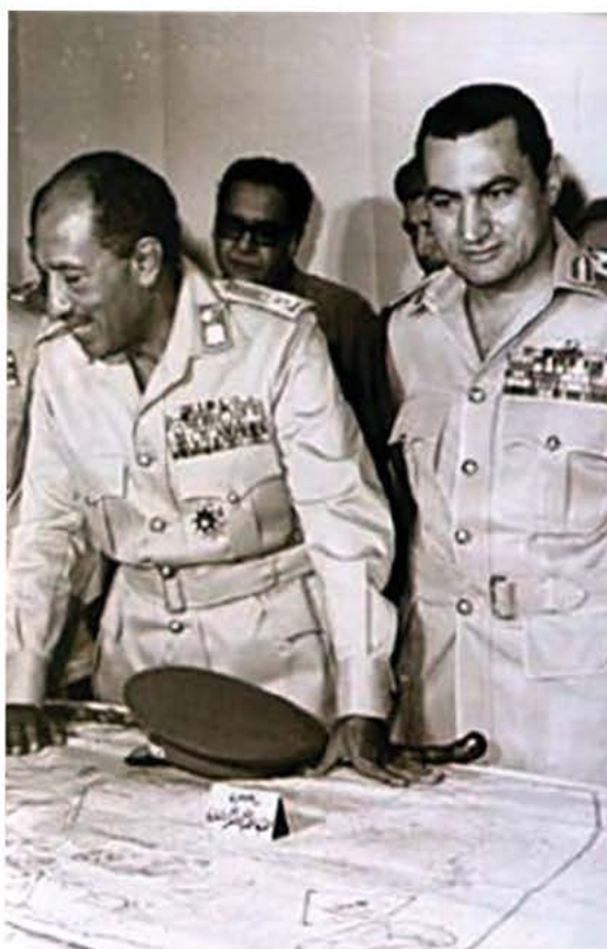
LEFT: Sadat and Mubarak go over war plans