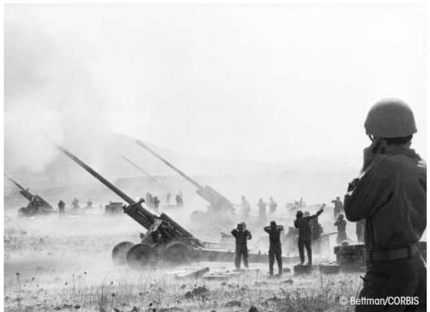
TOP: Israeli Artillery fires on Syrian positions, 12 October

The material on the period of the war itself attests to the range of issues, including tactical intelligence on the belligerents, US equities with Middle Eastern heads of state, the state of alert of other Middle Eastern militaries, the strategic interests of the United States vis-à-vis the Soviet Union, Muslim opinion internationally, the strength of the US dollar in global financial markets, and the potential ramifications of a US energy shortage during the coming winter. Of course these documents do not settle every debate. Many were not declassified for this release due to continuing sensitivities. The