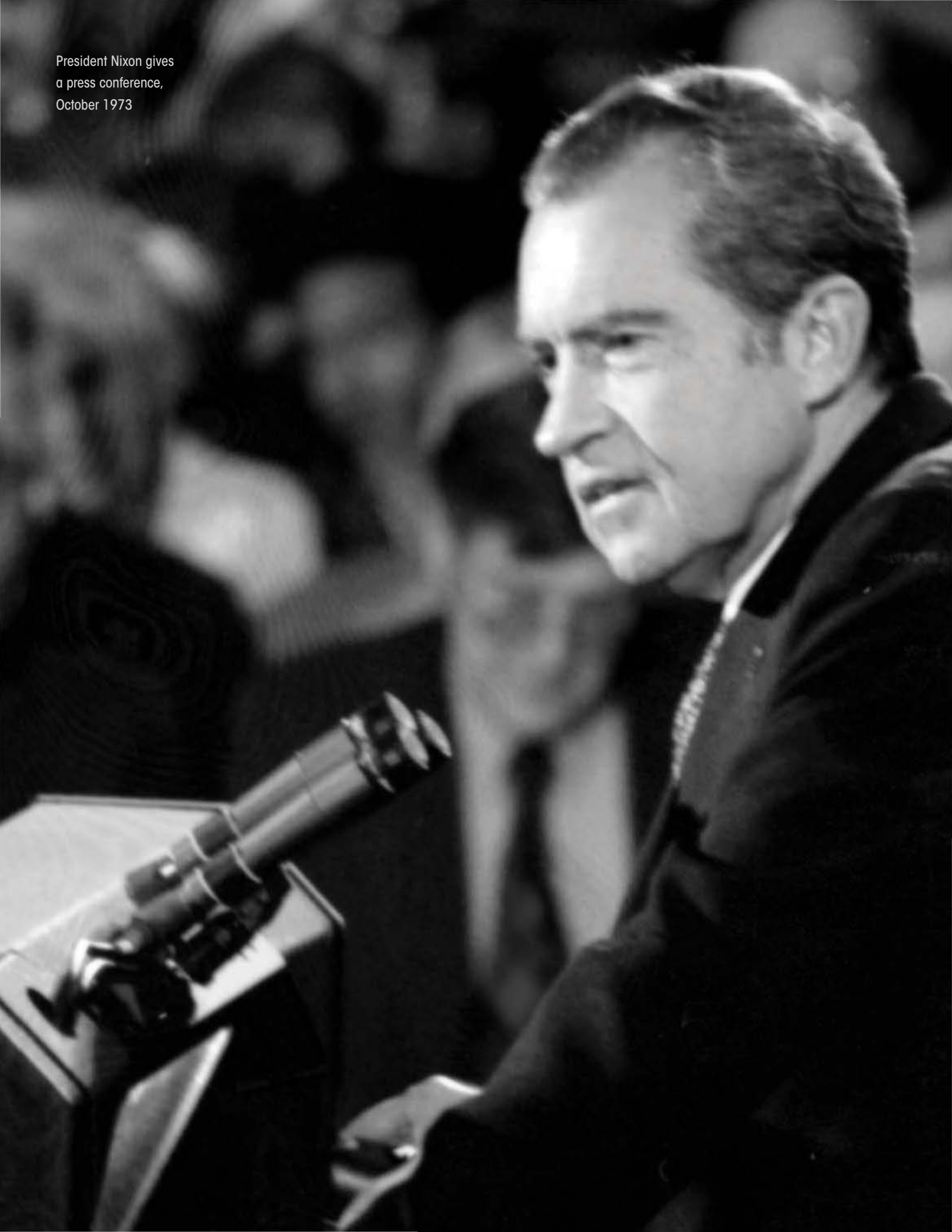
President Nixon gives a press conference, October 1973