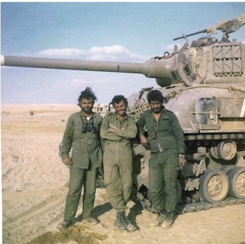
ABOVE: Israeli tank crew