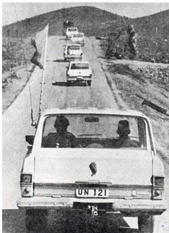
RIGHT: UN Officials on patrol

for his many meetings with Kissinger and other top policymakers during the crisis. 32 Colby also commissioned the candid postmortem report on the performance of US intelligence before the outbreak of the war. 33