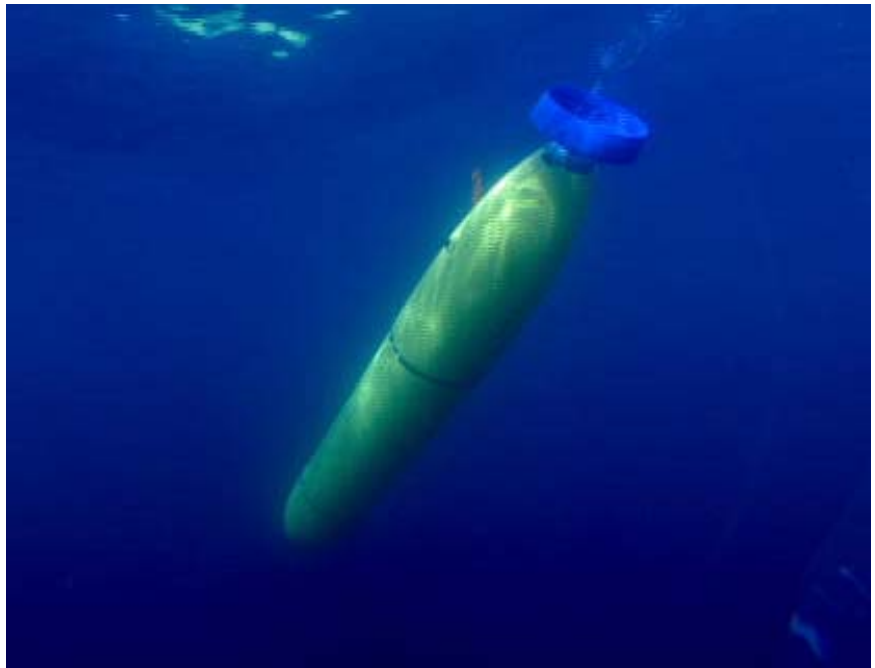
Figure 1: ALTEX vehicle diving from surface.

AUV development is focused on an initial experiment, which is to track the Atlantic layer intrusion into Arctic basin. We refer to the experiment as ALTEX for Atlantic Layer Tracking Experiment. ALTEX requires following the 1400 m isobath of the Nansen Basin, with occasional north-south excursions to probe the extent of the warm water intrusion. The vehicle will run at a depth of 275 m, but will obtain a full water column profiles on at least a daily basis. For this mission, the vehicle may not be recovered - data is reported by telemetry buoy. Ice thickness measurements are obtained during the telemetry buoy launch phase.