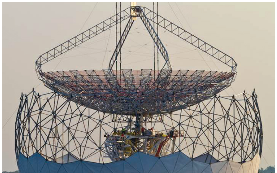
The new HUSIR backstructure with its quadrapod is lowered through the uncapped radome in preparation for integration with the yoke structure.

gyro-TWT operates at 35 kV, uses a solid-state high-voltage modulator, and employs a high magnetic field to control the electron beam.