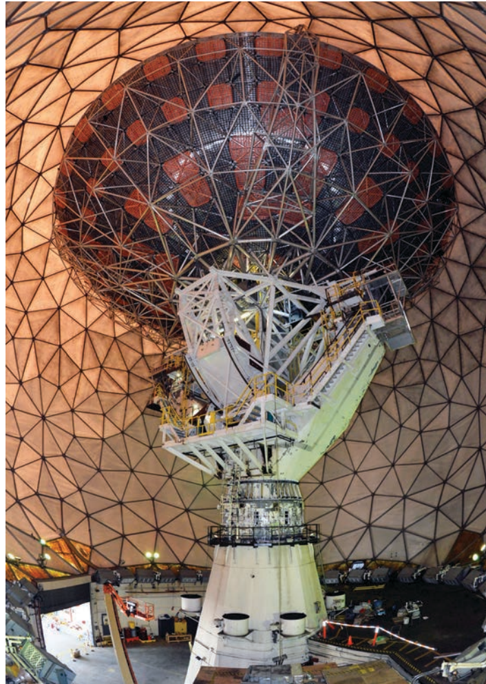
The completed Haystack Ultrawideband Satellite Imaging Radar is enclosed in a space-frame radome.

The Haystack radar facility in Westford, Massachusetts, originally built in the