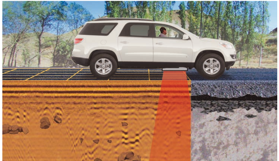
Localizing Ground-Penetrating Radar (LGPR) uses relatively stable subsurface features and their geolocation to locate the vehicle even in adverse weather conditions.

MIT Lincoln Laboratory has developed a sensor that provides real-time estimates of a vehicle's position even in challenging weather and road conditions. The Localizing Ground-Penetrating Radar (LGPR) uses very high frequency (VHF) radar reflections of underground features to generate baseline maps and then matches current GPR reflections to the baseline maps to predict a vehicle's location. The LGPR uses relatively deep subsurface features as points of reference because they are inherently stable and less susceptible to erosion or damage over time. It utilizes VHF radio waves because they can penetrate rain, fog, dust, and snow.