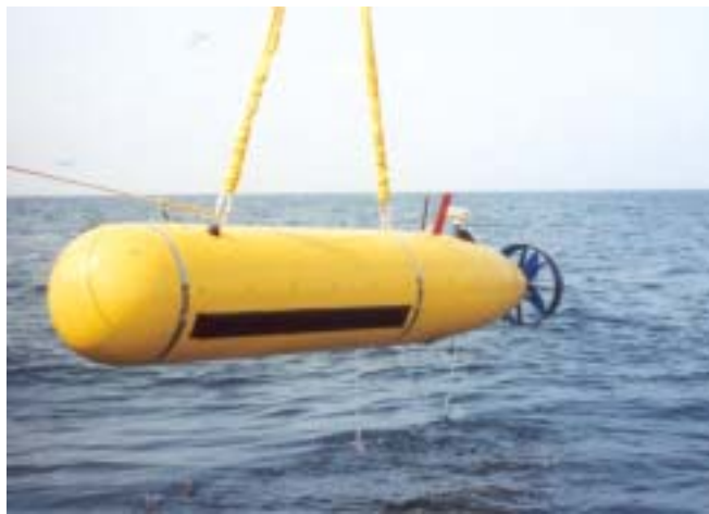
Figure 2: The Battlespace Preparation AUV (BPAUV) provides autonomous bottom mapping/classification and target localization capabilities for MCM missions.

The Battlespace Preparation AUV (BPAUV) , shown in Figure 2, is an ONR-funded program to produce a modular AUV for autonomous bottom mapping and classification. The high-resolution, multi-beam Klein 5000 side-scan sonar carried by the BPAUV allows the vehicle to be used to locate mine targets. Due to its modular section design, the BPAUV is capable of carrying different or additional sensors and payloads.