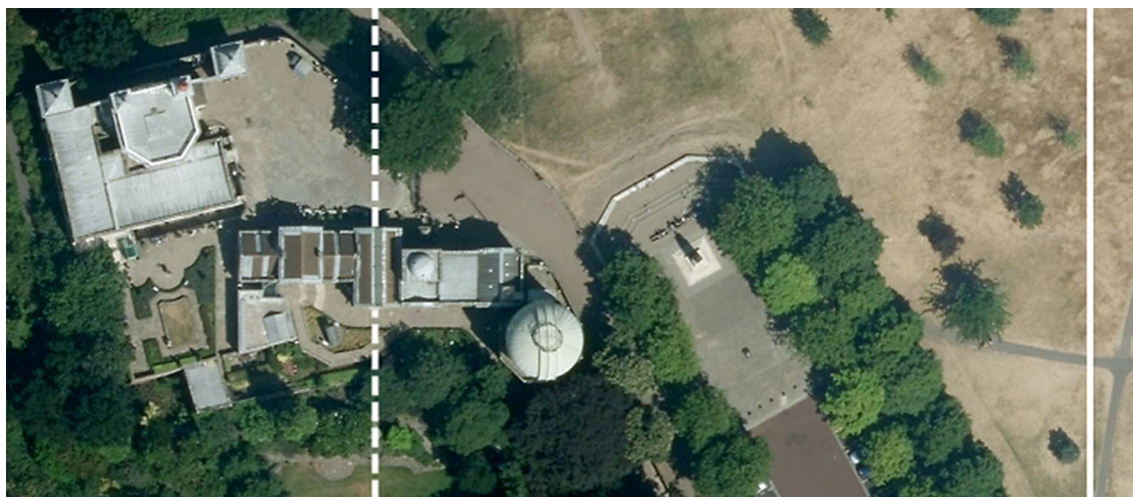
Fig. 1 The Airy meridian ( dotted line ) and the ITRF zero meridian ( solid line ).

longitude systems. Because books for the general public (e.g., Malin and Stott 1989; Howse 1997; Jennings 1999; Dolan 2003; Murdin 2009), as well as the web sites of the UK’s National Maritime Museum (Sinclair 1997) and Wikipedia (IERS Reference Meridian 2014), either ignore the longitude offset at Greenwich, acknowledge it but do not assign a cause, or provide incorrect accounts, the authors also consider some of the conjectured explanations in Sect. 5.