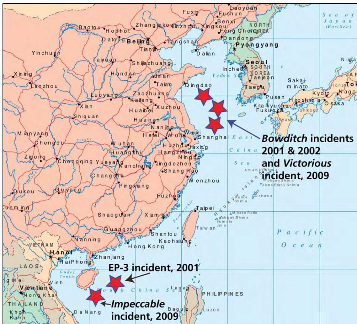
Figure 2. Locations of 2001, 2002, and 2009 U.S.-Chinese Incidents at Sea and In Air