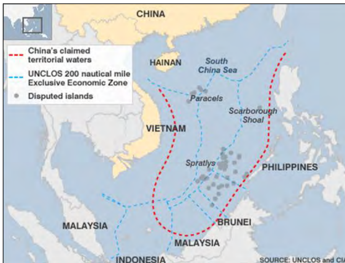
Figure 4. EEZs Overlapping Zone Enclosed by Map of Nine-Dash Line