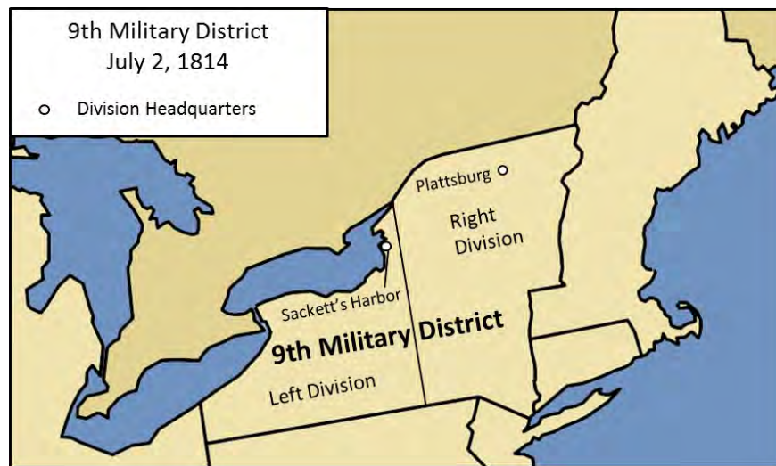
Figure 7. United States 9th Military District, 1814

After relieving Wilkinson, Armstrong reorganized military forces within the 9th Military District to include two divisions and opted not to appoint a new commander. Izard would command the Right Division on Lake Champlain and Brown would command the Left Division, which was responsible for the area from Buffalo to Ogdensburg (see figure 7). 9 Armstrong directed Izard and Brown to command their assigned division with each general receiving orders directly from the War Department. He tried to avoid the unity of command issues he experienced with Hampton and Wilkinson by indicating that Izard, by virtue of him outranking Brown, would command when the two were united for combined operations.