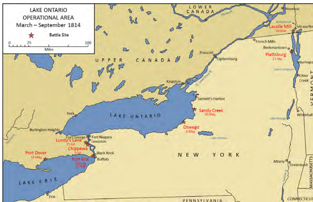
Figure 8. Lake Ontario Operations, 1814