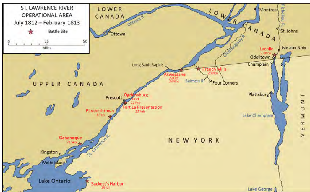
Figure 4. Campaign in the East, 1812–1813

Considered the most strategically important theater of American operations because control of the area would sever British supply lines to Upper Canada, the northern theater of operations encompassed Montreal in the north, Kingston and Upper Canada in the west, and Plattsburg, New York in the south (see figure 4). 18 Control of the waterways was essential to conducting operations in this region. Kingston served as the main British naval base while Sackett's Harbor was the main American naval base. Dense wilderness limited activities to the corridors formed by the eastern portion of Lake Ontario and the St. Lawrence River, and through Lake Champlain and Plattsburg. Both American and British forces used these corridors as avenues of approach during the war.