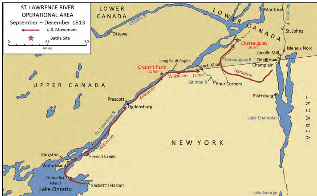
Figure 5. The Advance on Montreal, October–November, 1813