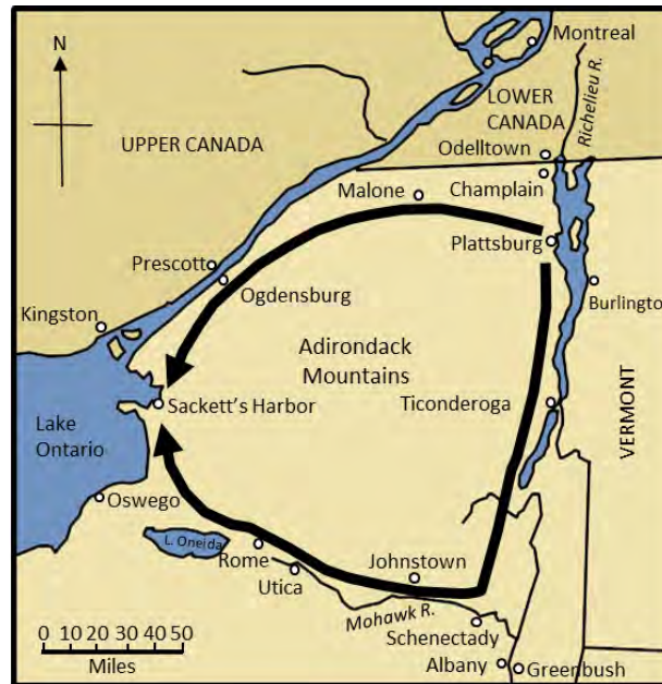
Figure 9. Two Routes to Sackett's Harbor

advancing on Plattsburg only a few days after his departure were almost prophetic as Prevost would lead 12,000 men southward less than a week later. 63