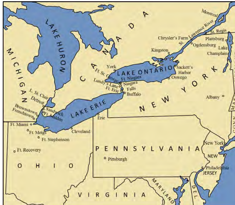
Figure 3. The Northern Seat of War (War of 1812)