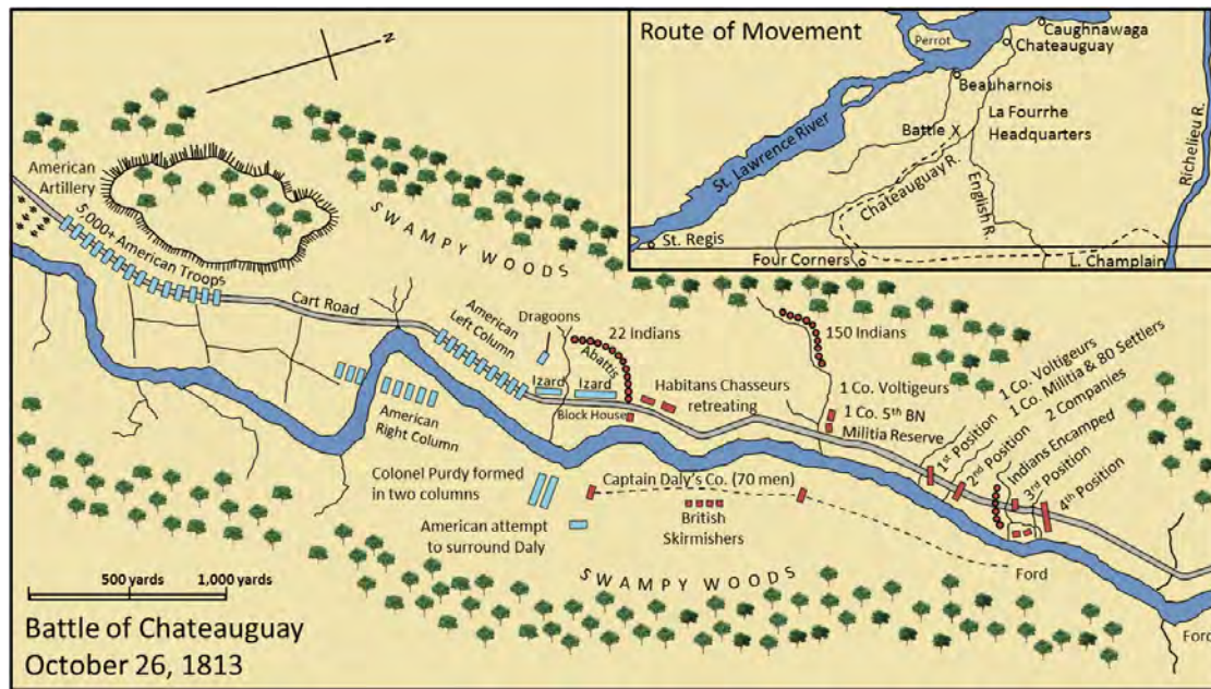
Figure 6. The Battle of Chateauguy