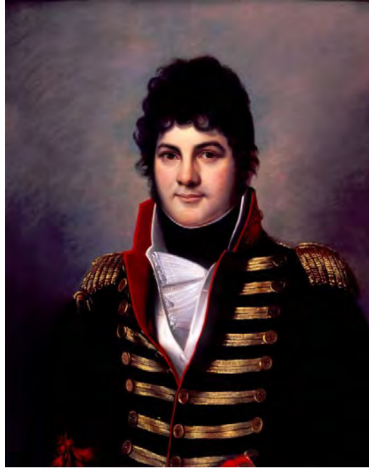
Figure 2. General George Izard

Source: Charles Bird King, 1813, oil on board (28 3/4 x 23 1/2 in.), Arkansas Arts Center Foundation Collection: Gift of Fred W. Allsopp. 1938.029.