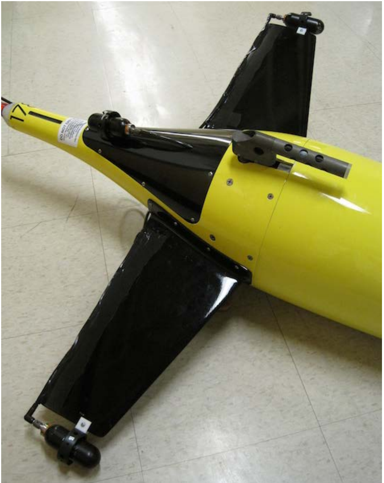
Figure 2. Seaglider™ S/N 178 with three HTI-99-HF hydrophones – one on each wingtip and one in the original position on the centerline.