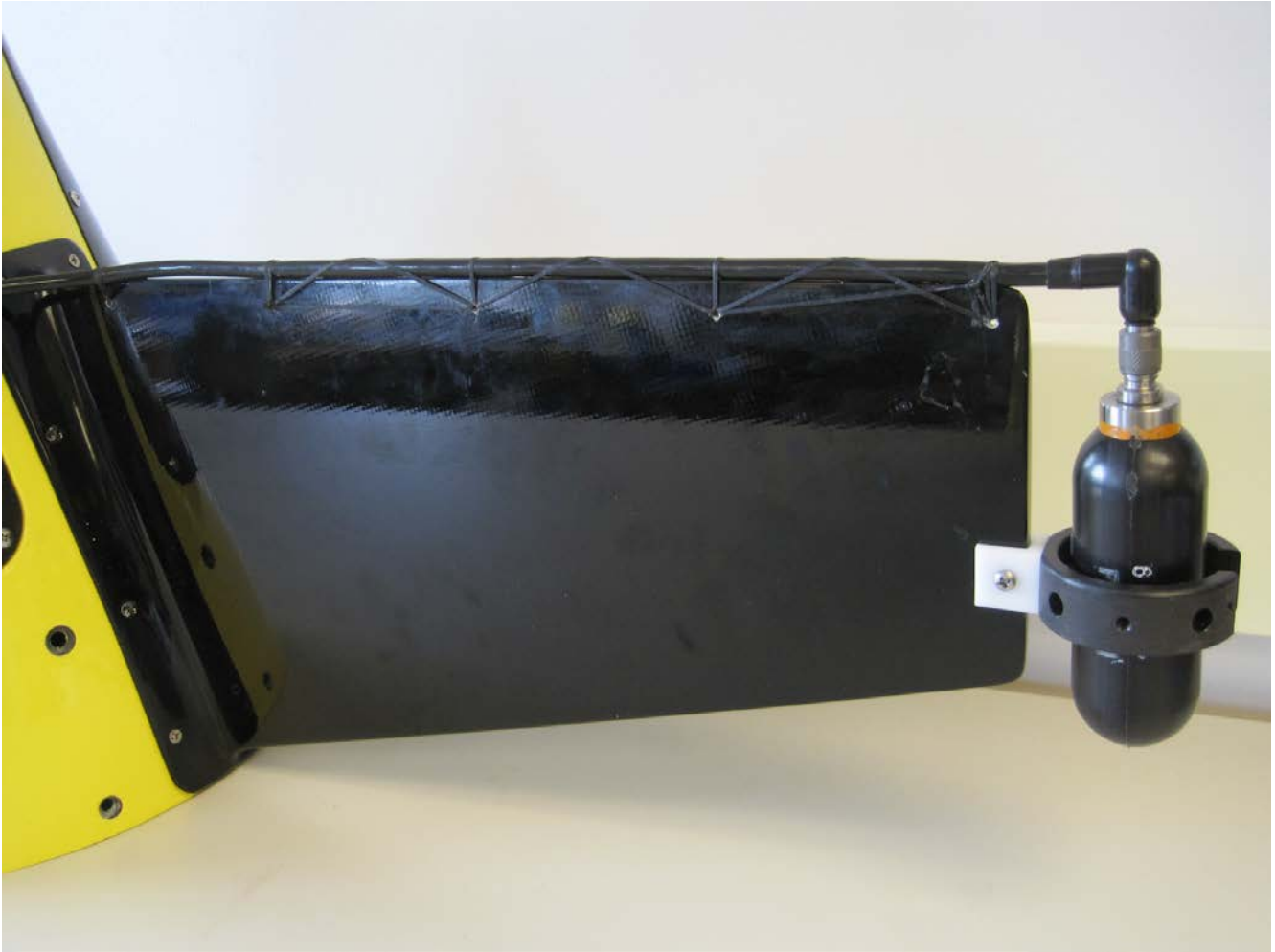
Figure 1. SeagliderS/N 178 aft fairing with port wing and wingtip-mounted HTI-99-HF hydrophone. Aft is up in this picture; the hydrophone cable is routed and lashed along the trailing edge of the wing, then through a hole in the dorsal Seaglider™ aft panel. An mirror-image installation was done on the starboard wing. The lashing was covered by black tape during the initial field trial.