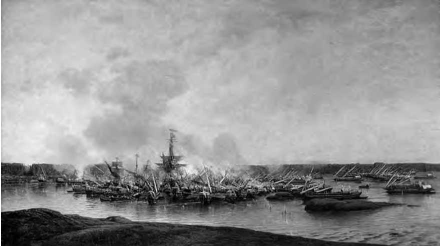
Hangö Udd and the battle depicted above.

During the Cold War, the Swedish Navy learned that many afloat sensors and weapon systems were solely designed for blue water operations and not for the littoral or near shore operations of existential interest for the Swedish Navy. In October, 1981, the Soviet “Whiskey class” submarine, commonly but erroneously known as “U 137”, ran aground