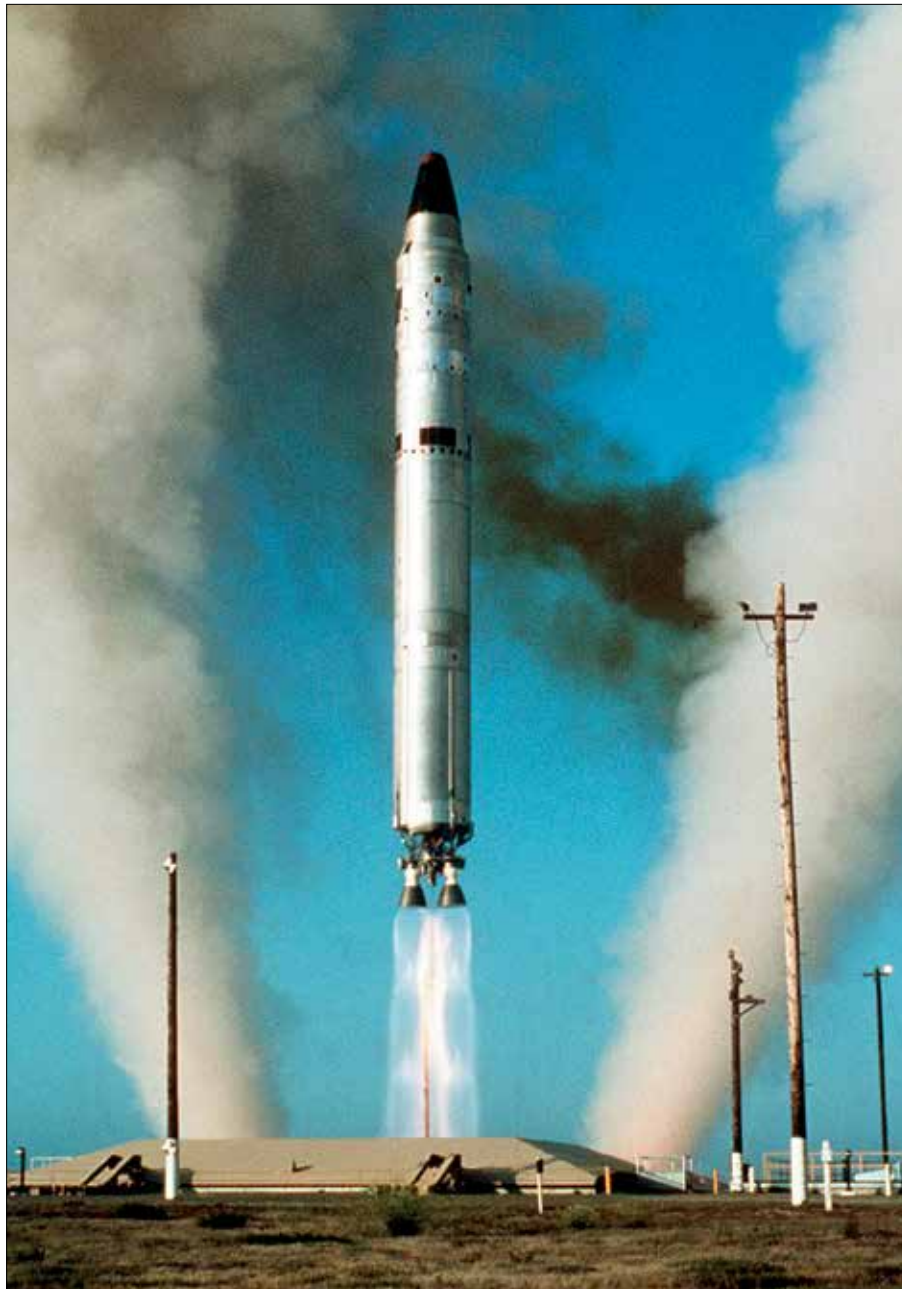
Test launch of LGM-25C Titan II ICBM from underground silo at Vandenberg Air Force Base during mid-1970s

attempted attacks at a rapid pace, and if a failure of U.S. theater or national missile defense allowed China's attacks to be successful, the pace of U.S. launch could be adjusted accordingly.