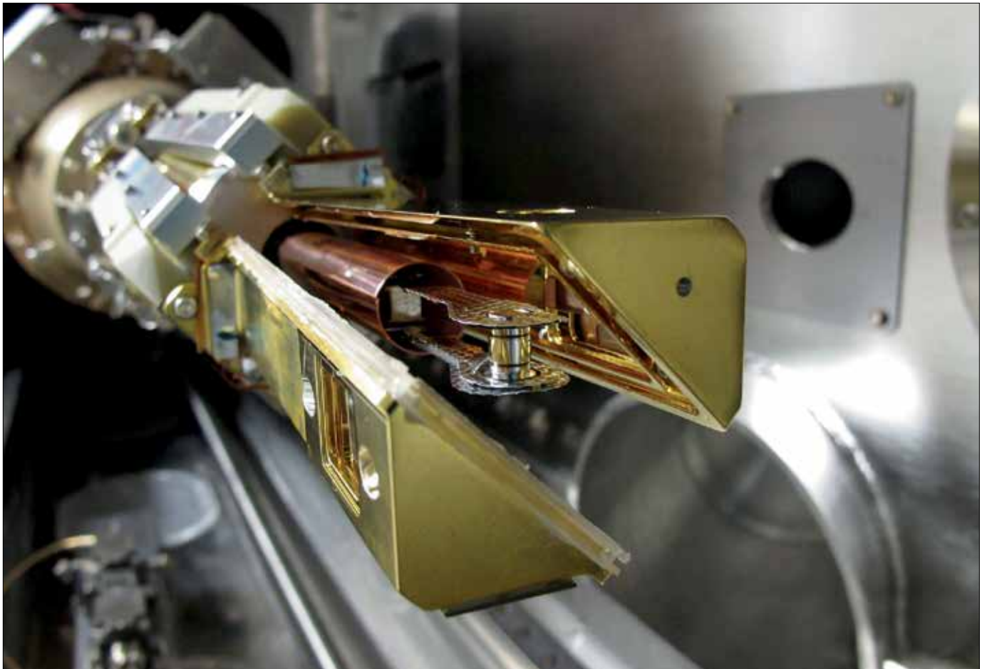
Target assembly for National Ignition Facility's first integrated ignition experiment is mounted in cryogenic target positioning system, while two triangle-shaped arms form shroud around cold target to protect it before shot (Lawrence Livermore Research Laboratory)

when it comes to choosing peace or conflict. There is evidence that the Sino-U.S. relationship will be predominantly adversarial. Henry Kissinger recently noted, “Enough material exists in China’s quasi-official press and research institutes to lend some support to the theory that relations are heading for confrontation rather than cooperation.” 32