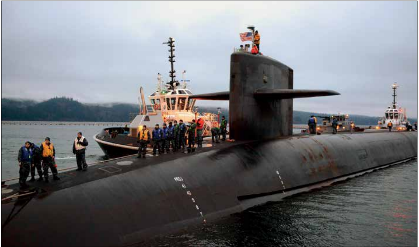
Blue crew of Ohio -class ballistic missile submarine USS Nevada prepares to moor as submarine returns home to Naval Base Kitsap-Bangor following strategic deterrent patrol

Many current discussions of the likelihood of conventional confrontation leading to nuclear conflict are not logically consistent. Writers often simplify their analyses and presume the use of nuclear weapons is so unlikely it can simply be ignored. As an example, defense policy advisor Michael Pillsbury specifically depicts 16 Chinese fears, 6 of which specifically apply to conventional crisis or conflict scenarios: fear of an island blockade, fear of aircraft carrier strikes, fear of major airstrikes, fear of attacks on strategic missile forces, fear of jamming or precision strikes, and fear of attacks on antisatellite capabilities. 39 Yet despite China's proximate fears, some analysts propose strategies that directly stimulate those fears while ignoring the nuclear threat. 40