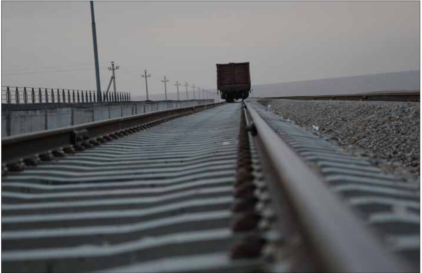
New track from Uzbekistan border to just beyond Mazar-e-Sharif lets Afghan traders import and export goods

the national railway on its own, sufficient financing is essential from both the international financial community and private sector. To encourage investment by financiers, GIRA must ensure that capital and operating cost estimates for projects are accurate; the appropriate laws, policies, and regulations are in place; and an overall project manager is appointed to plan and manage initial development. Land grants could also serve as a means to finance national railway construction.