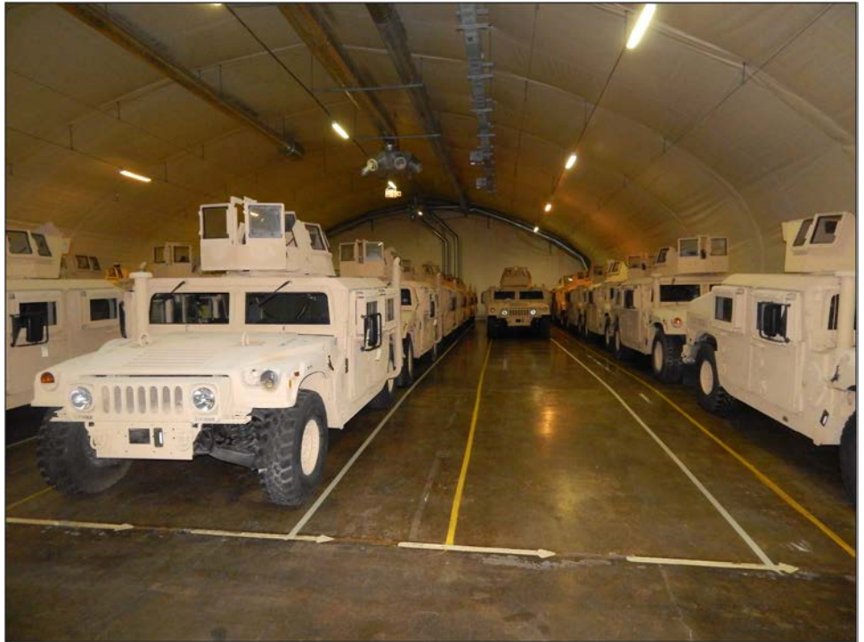
Figure 4: HMMWVs at Frigard Cave, Norway, 2014