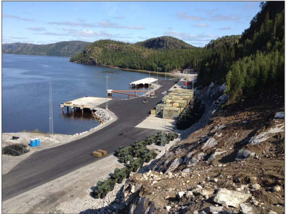
Figure 2: Norwegian Constructed Pier in Hammernesodden, Norway, 2014

GAO-15-651