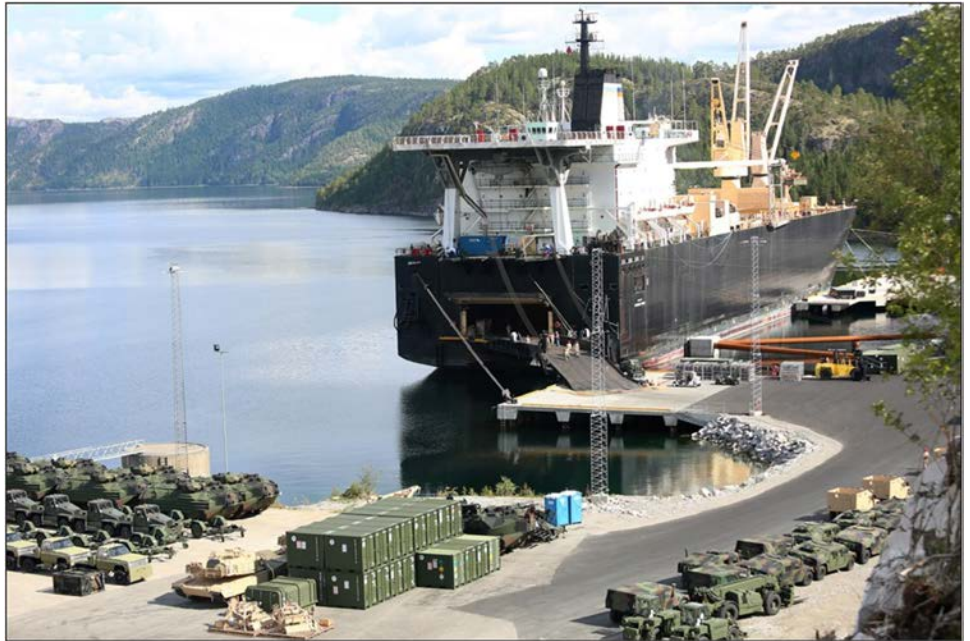
Figure 3: Equipment Offloading USNS Williams at Pier in Hammernesodden, Norway, 2014

Source: Marine Forces Europe and Africa. | GAO-15-651