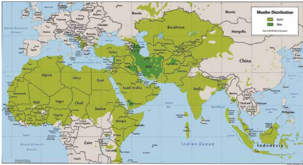
Figure 2. Sunni and Shia Muslim Distribution

its strategy. Its targeting of Shi'ites was a major contributing factor in the Iraqi sectarian civil war that peaked in 2007. The group's ranks greatly diminished from the U.S. troop surge and the Sahwa's counterterrorism efforts. However, ISIS mounted a comeback due to the institutional marginalization of Sunnis by the government of Nouri al-Maliki, and the civil uprising in Syria. Sectarian attacks increased again in Iraq in 2012 after the United States had fully withdrawn from the country. 6